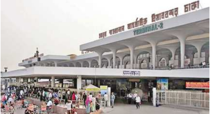
TUHIN SHUBHRA ADHIKARY and RASHIDUL HASAN

High-level meeting on PPP to discuss the proposal today