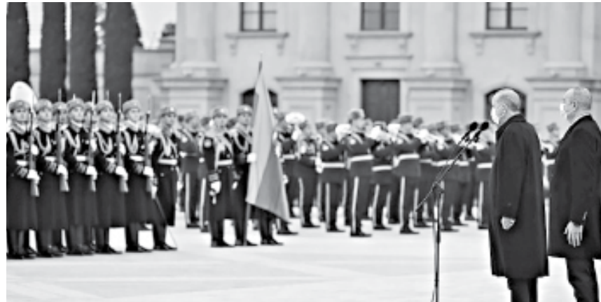
Turkish President Recep Tayyip Erdogan and Azerbaijan's President Ilham Aliyev at a victory parade in Baku, Azerbaijan.