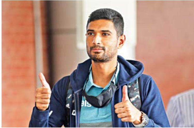
Bangladesh T20I captain Mahmudullah Riyad and ODI captain Tamim Iqbal arrive at the Hazrat Shahjalal International Airport yesterday ahead of their departure for New Zealand. The Tigers are slated to play three ODIs and as many T20Is in a country where they have not won a single international match in their cricketing history.