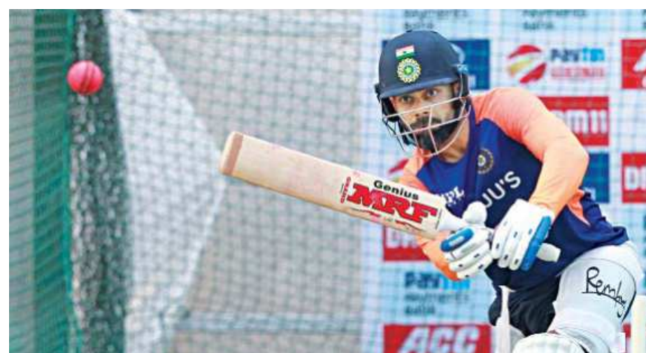
India skipper Virat Kohli practises at the nets with the pink ball ahead of the third Test against England which starts in Ahmedabad today.

"One thing that stands out to me is the vital first 20 balls -- making sure you get used to tracking the ball, get used to the conditions and being very aware of how things can change throughout the day."