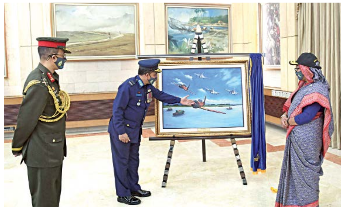
An Air Force official hands a memento to Prime Minister Sheikh Hasina at the Gono Bhaban yesterday marking the handover of the National Standard to 11 and 21 squadrons of Bangladesh Air Force.

Air Chief Marshal Masihuzzaman Serniabat, on behalf of the premier, handed the national flags to 11 and 21 squadrons of Bangladesh Air Force.