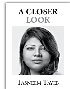
A CLOSER LOOK

DSCC's short-sighted drive to remove four lakh rickshaws