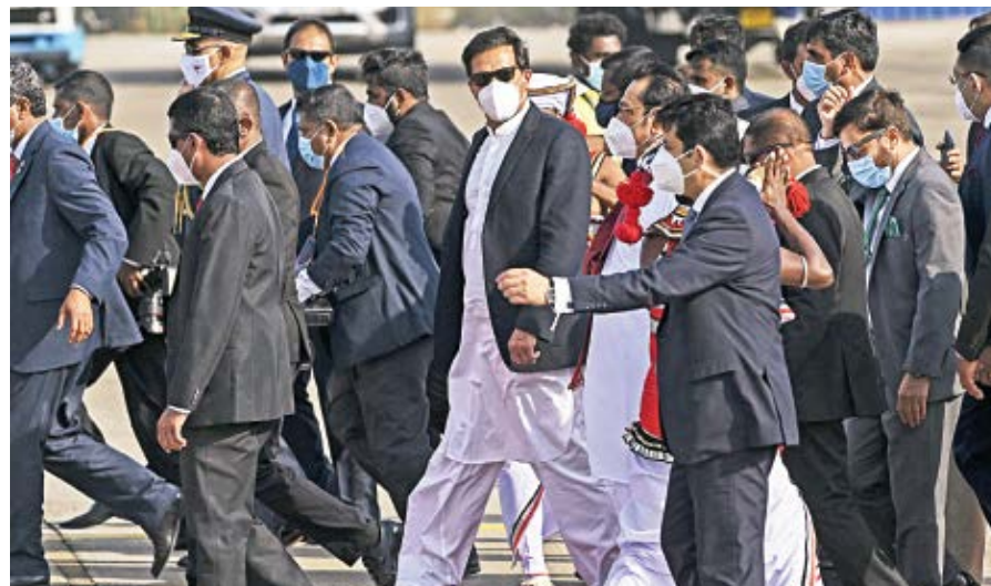
Pakistan's PM Imran Khan (C) walks with his Sri Lankan counterpart Mahinda Rajapakse (center R in white) at Bandaranaike International Airport in Katunayake yesterday after Khan arrived for a two-day official visit to Sri Lanka. India yesterday allowed Imran Khan's airplane to use its airspace to visit Sri Lanka. In 2019, Pakistan had denied opening its airspace for Indian Prime Minister Narendra Modi's flights to the US and Saudi Arabia citing alleged human rights violations in Kashmir.

The social media firm sparked global outrage last week by blacking out news for its Australian users in protest at the proposed legislation, and inadvertently blocking a series of non-news Facebook pages linked to everything from cancer charities to emergency response services.