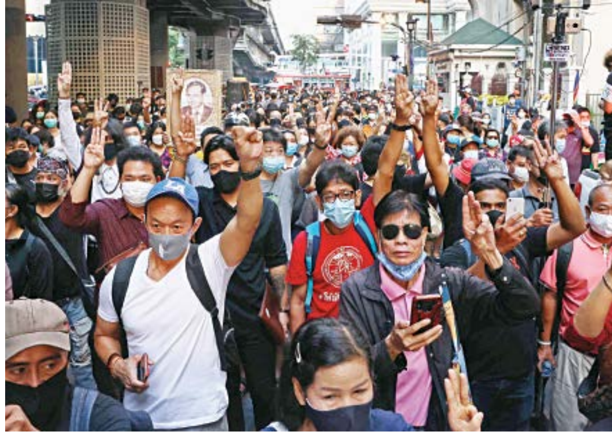
Protesters hold up the three finger salute as they take part in demonstration against police and government corruption in Bangkok, Thailand yesterday.

After initially denying the existence of the camps in Xinjiang, China later defended them as vocational training centers aimed at reducing the appeal of Islamic extremism.