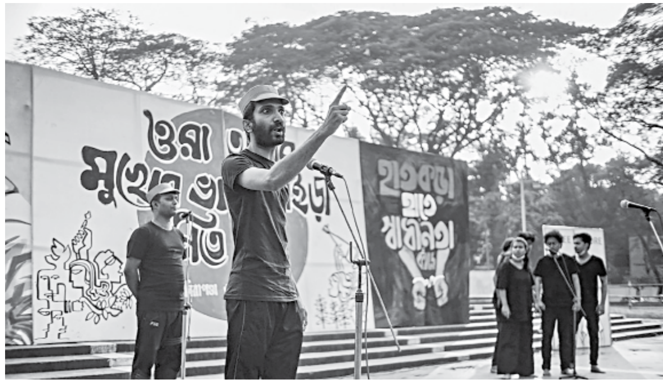
A group of citizens organised a protest at the Shaheed Minar in Dhaka on February 13, 2021 demanding the government abolish the Digital Security Act.