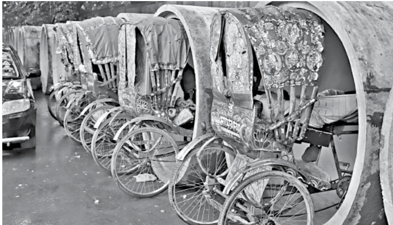
Rickshaw-pullers sheltering from the rain inside sewage pipes/cylinders kept beside the road in Dhaka in 2019.

Instead of taking these whimsical—and at best piece-meal—measures to ease Dhaka's road congestion, the policymakers must look at the broader socioeconomic picture that is enabling this problem. Dhaka's traffic nightmare is not a black and white issue. If anything, it