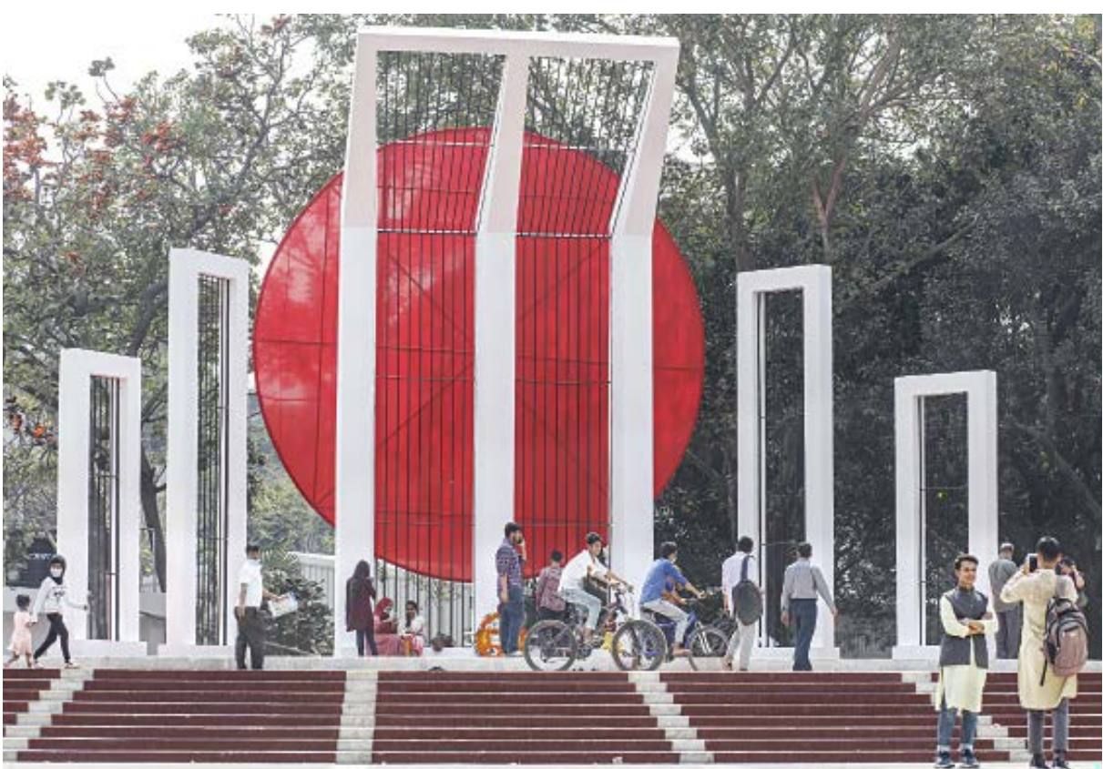
Just a couple of days after Amar Ekushey, two children ride bicycles while many other people walk on the foot of the Central Shaheed Minar with their shoes on yesterday. To protect the sanctity of the memorial for Language Movement martyrs, the High Court even issued an order prohibiting such activities there.