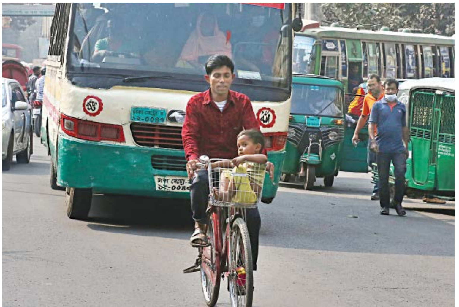
With his baby seated precariously in the basket, a man takes the child out on a bicycle in the city. He is amongst fast-moving vehicles in the middle of the street. A bus behind is also trying to pass him. The photo was taken in the capital's Shahbagh area yesterday.

served the departments responsible for monitoring NBFIs, gained undue benefits from scammers between 2002 and 2019. Taking the benefits, the officials remained silent regarding different irregularities in the NBFIs, it said.