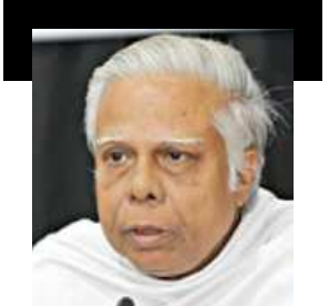
Syed Abul Maksud (1946-2021)