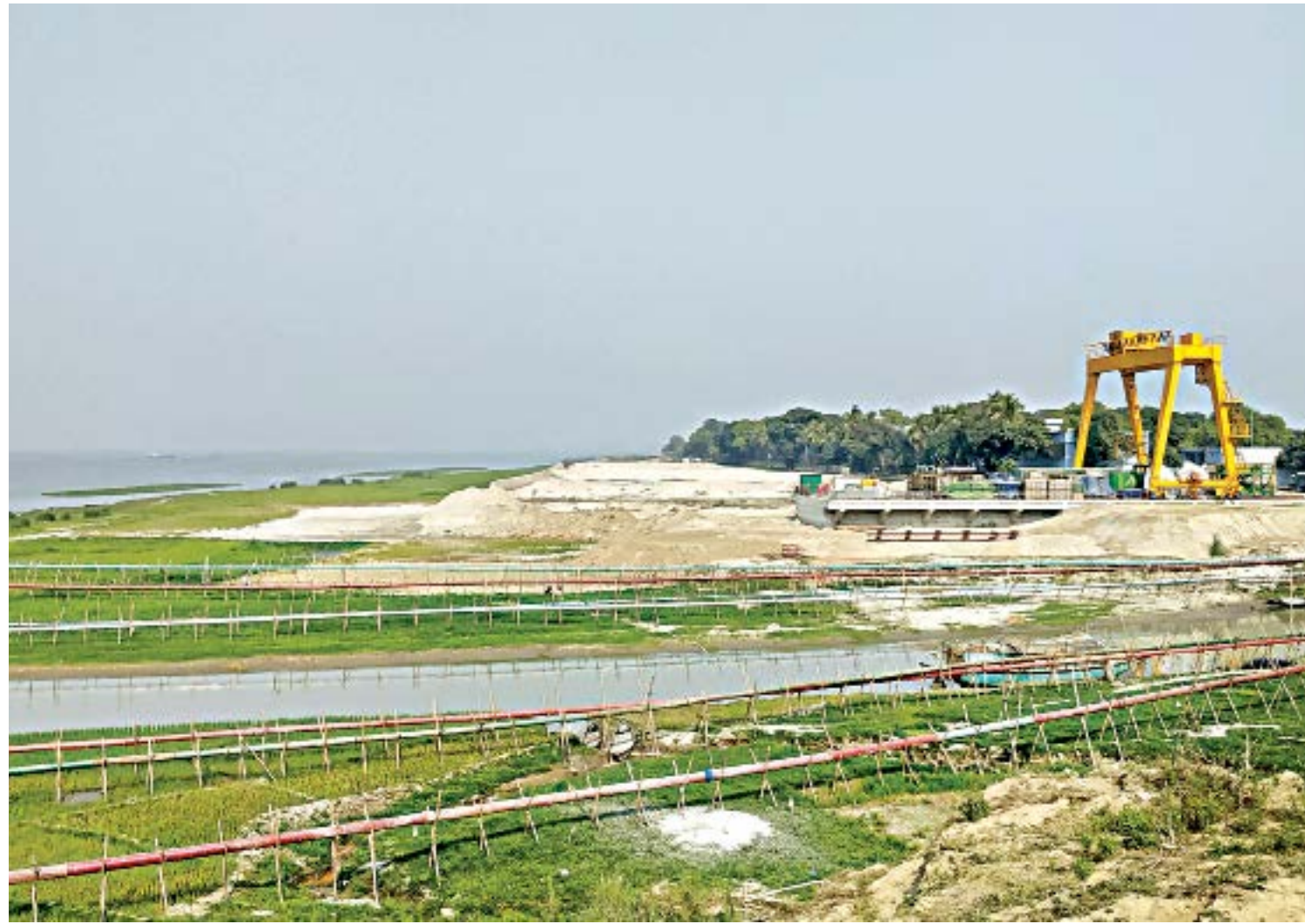
Sand from the Meghna being pumped to the shore via large pipes to fill up the bank to construct a new Ashuganj Power Plant unit in Brahmanbaria. The photo was taken recently.