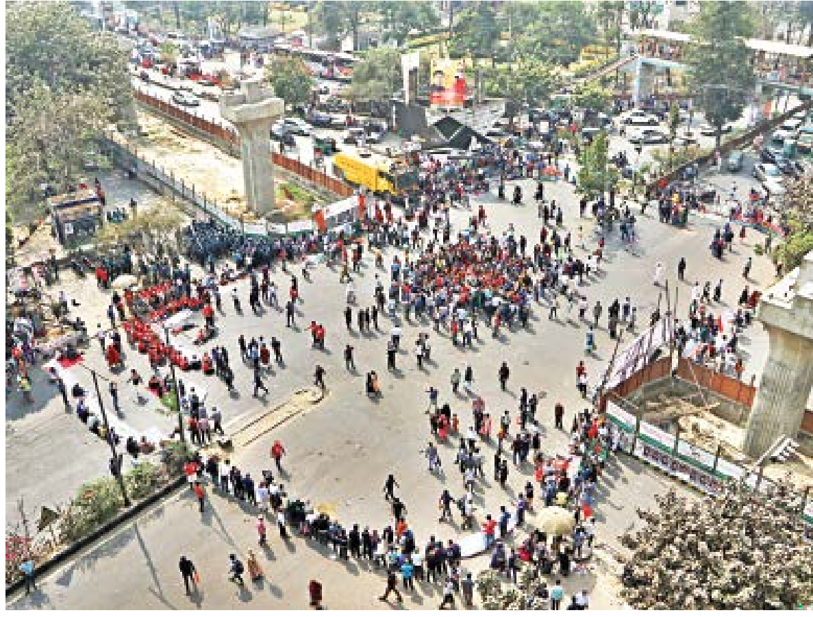
Bangladesh Mukhtijoddha Santan Sangsad, a platform of freedom fighters' children, staged a sit-in, blocking the capital's Shabbagh intersection yesterday to press home their seven-point demand, including reinstatement of 30 percent quota in government services.

According to the survey, only 10 percent of people received benefits from the new programmes initiated to tackle pandemic-induced shocks, SEE PAGE 4 COL 2