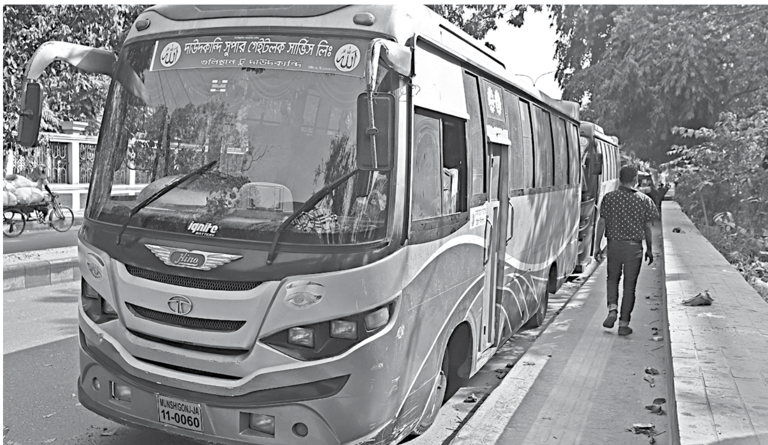
The space between Bangabhaban and Mohanagar Natya Mancha in the capital remains occupied by long-distance buses all year-long, especially those of the Cumilla and Daudkandi routes. The result is long traffic jam in the surrounding areas. This photo was taken yesterday.