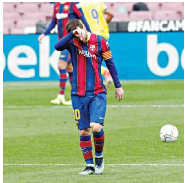
Barcelona superstar Lionel Messi, who put his side ahead in the 32nd minute against Cadiz, looks dejected after an 89th-minute equaliser from Alex Fernandez at the Camp Nou on Sunday.

Barca are third in the standings on 47 points, trailing leaders Atletico by eight points and second-placed Real Madrid by five points. Cadiz are 14th on 25 points.