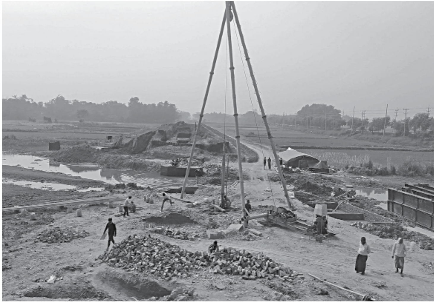
Due to lack of supervision of the contractor, only 30 percent of the Kulaura-Shahbajpur rail track rehabilitation work in Moulvibazar has been completed. However, the deadline for the rehabilitation work has expired in December last year.

The project was approved at the meeting of Executive Committee of the National