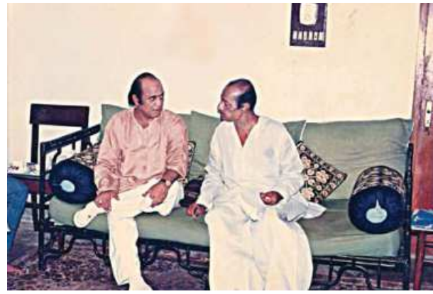
With Ustad Mehdi Hassan.