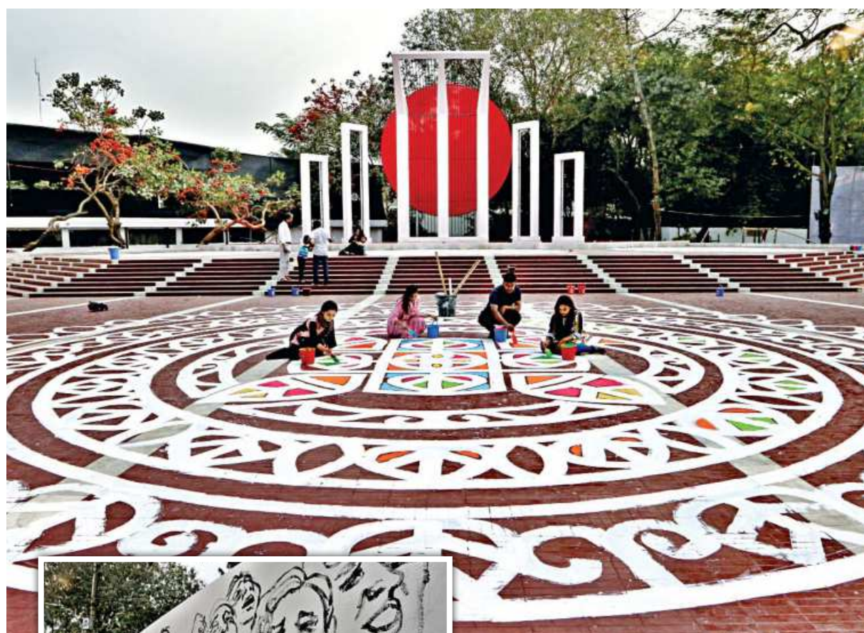
Volunteers paint graffiti at Central Shaheed Minar yesterday as part of the last-minute preparations for observing Amar Ekushey and the International Mother Language Day tomorrow. On this day, the nation pays glowing tributes to the martyrs of the historic Language Movement.