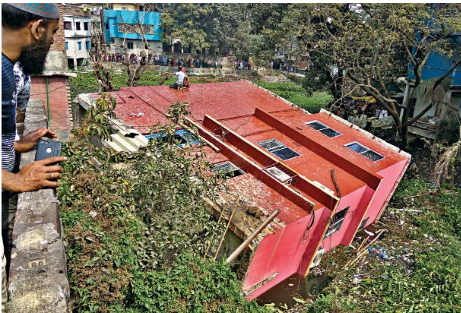
A three-storey building lying on its side after it toppled in Keraniganj's Charail Khelarmath area yesterday morning. Members of the fire service rescued eight people -- seven of them injured -- from the building. Officials said it might have collapsed due to faulty construction.