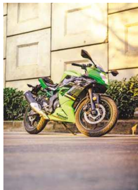
Kawasaki Ninja 125

What looks like a shrunken down Q8 that is good for Dhaka roads and the wallet. Premium upholstery and triple-zone cooling will keep your buttocks soft and head cool in traffic.