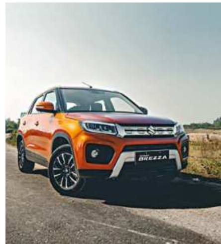
Suzuki Vitara Brezza

This time though we did it all without anyone from our team getting slightly mutilated. No one got run over. No photographer got hit by tree branches. No reviewer got stuck in a dealership washroom. All this happened before but no one speaks about it because we keep everything hush with bribes of free octane. This year, people just put on weight because for one of our test drives, we bought pizzas. Lots of pizzas. And we ate it all in the name of science. All because we are very 'sciency'. Can't believe it took this long to get another magazine out though. Much like the 0-100kmph times of a Tata Nano. But it happened. And we have a treat for you. But not pizza. Because we ate all of it.