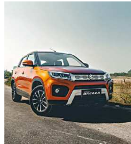
Suzuki Vitara Brezza

This time though we did it all without anyone from our team getting slightly mutilated. No one got run over. No photographer got hit by tree branches. No reviewer got stuck in a dealership washroom. All this happened before but no one speaks about it because we keep everything hush with bribes of free octane. This year, people just put on weight because for one of our test drives, we bought pizzas. Lots of pizzas. And we ate it all in the name of science. All because we are very 'sciency'. Can't believe it took this long to get another magazine out though. Much like the 0-100kmph times of a Tata Nano. But it happened. And we have a treat for you. But not pizza. Because we ate all of it.