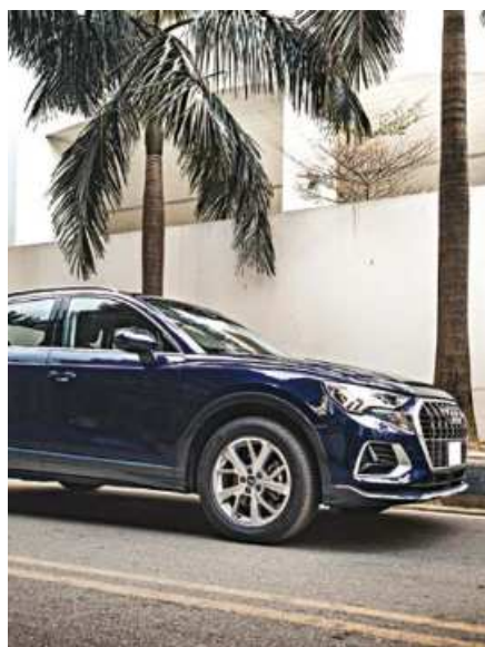
Audi Q3 35 TFSI

British elegance meets Chinese manufacturing. We test to see if it's a match made in heaven or British Leyland 2.0.