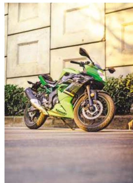
Kawasaki Ninja 125

The smallest sibling has a dual identity. Driven clumsily, it's an average commuter. A bit of downshifting and rematching, and the monster awakes.