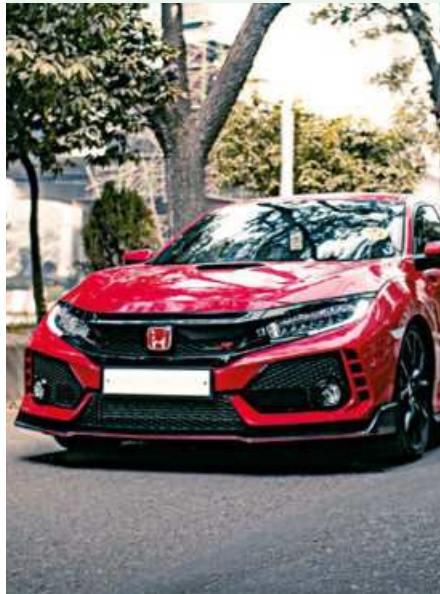
2020 Honda City RS

We take the Honda's newest red nose hot hatch and see if it's up for the Dhaka life. We also deliver a few boxes of pizza along the way.