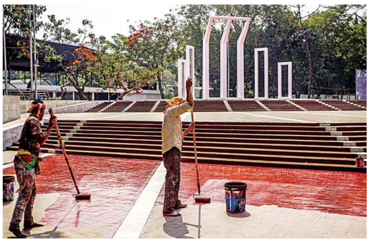
Preparations are going on to mark the International Mother Language Day on February 21. The Central Shaheed Minar is getting a new coat of paint after cleaning up. People from all walks of life through there to pay tribute to the language movement martyrs on that day.

ANTI-COUP PROTESTS IN MYANMAR Hackers target govt portals AFP, Yangon Hackers targeted Myanmar government websites yesterday to protest against the military coup, as the junta pressed on with its attempts to stymie nationwide opposition with internet blockades and troop deployments. The cyberattacks came a day after tens of thousands of people rallied across the country to protest against the generals toppling Aung San Suu Kyi's civilian government earlier this month. A group called Myanmar Hackers disrupted websites including the Central Bank, the Myanmar military's propaganda page, state-run broadcaster MRTV, the Port Authority, and the Food and Drug Administration. "We are fighting for justice in Myanmar," the group said on its Facebook page. "It is like mass protesting of people in front of government websites." Internet access was severely curtailed for the fourth night running at about 1:00 am yesterday (1830 GMT Wednesday), according to NetBlocks, a Britain-based group that monitors internet outages around the world. It said connectivity had dropped to just 21 percent of ordinary levels, and was restored eight hours later ahead of the start of the working day. For a second day, motorists in Yangon blockaded roads with vehicles, leaving their bonnets up and pretending they were broken down to stop security forces from moving around Myanmar's biggest city. SEE PAGE 14 COL 1