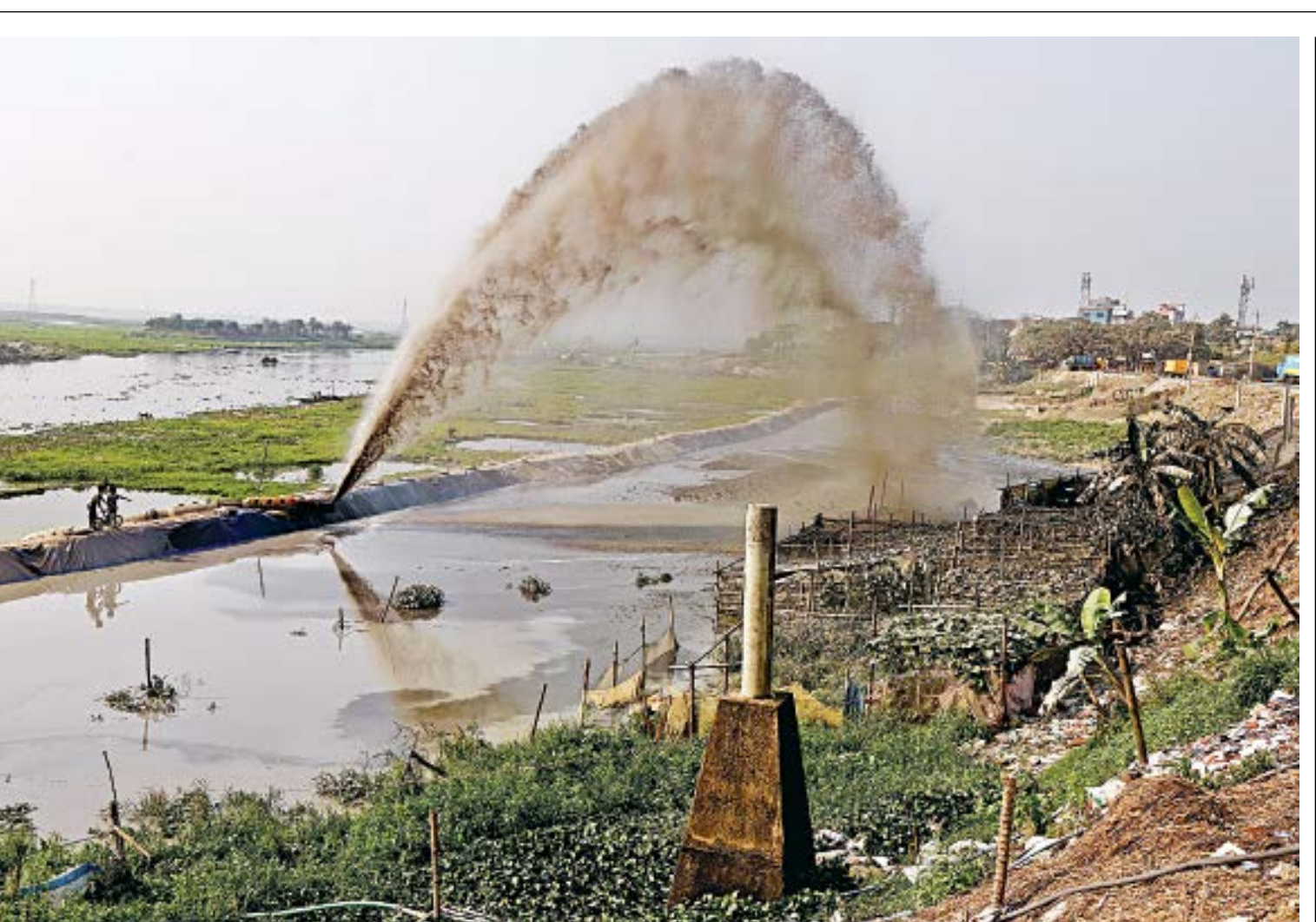
Dredging of the Turag river going on in the capital's Mirpur Beribadh to increase the navigability of the river, which bears a dried-up appearance. The photo was taken yesterday.

under the narcotics control and arms acts. SEE PAGE 14 COL 1