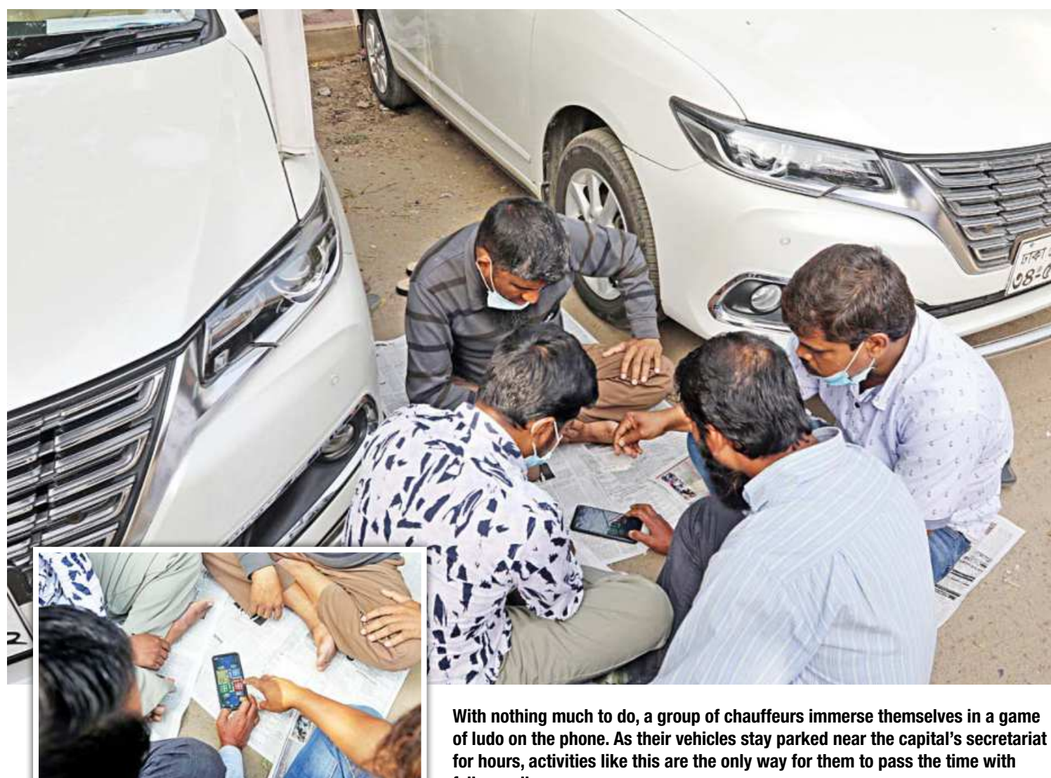
With nothing much to do, a group of chauffeurs immerse themselves in a game of ludo on the phone. As their vehicles stay parked near the capital's secretariat for hours, activities like this are the only way for them to pass the time with fellow colleagues.