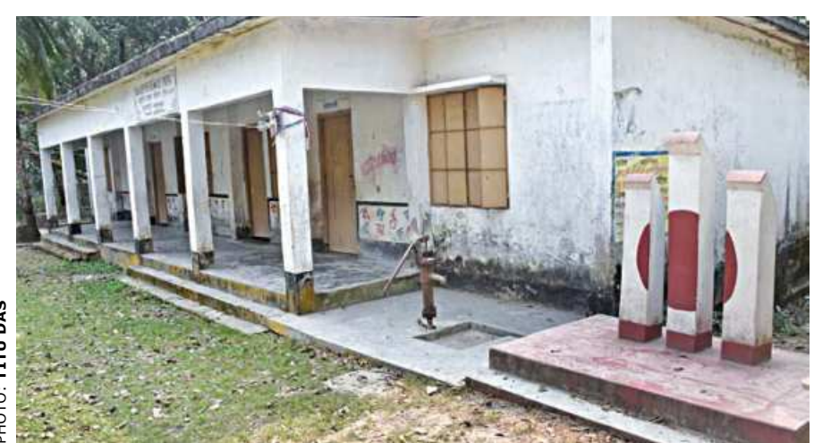
A small Shaheed Minar built by local enthusiasts at Chandpasha Board Government Primary School in Babuganj, Barishal. The photo was taken this week.