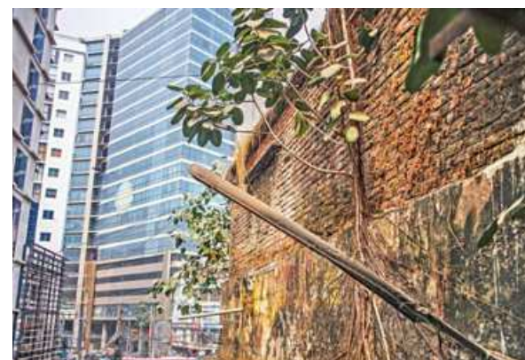
Top, The dilapidated DNCC 'Kacha Bazar' with unplastered outer walls of the second floor visible from the outside, that the shop owners' committee "built themselves". Left, to-let signs for renting out shops on the third floor are a common sight inside the market. Right, plants are growing on the second-floor walls, with the DNCC building visible right behind.