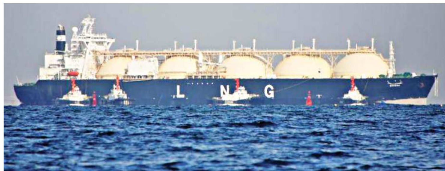
In January, Asian spot LNG prices rose to unprecedented levels due to cargo shortages, transportation bottlenecks and supply outages.

In May 2019, Summit LNG Terminal Co Ltd, the country's second LNG terminal, began supplying re-gasified LNG. The unit has a capacity of supplying 500 million cubic feet of re-gasified LNG.