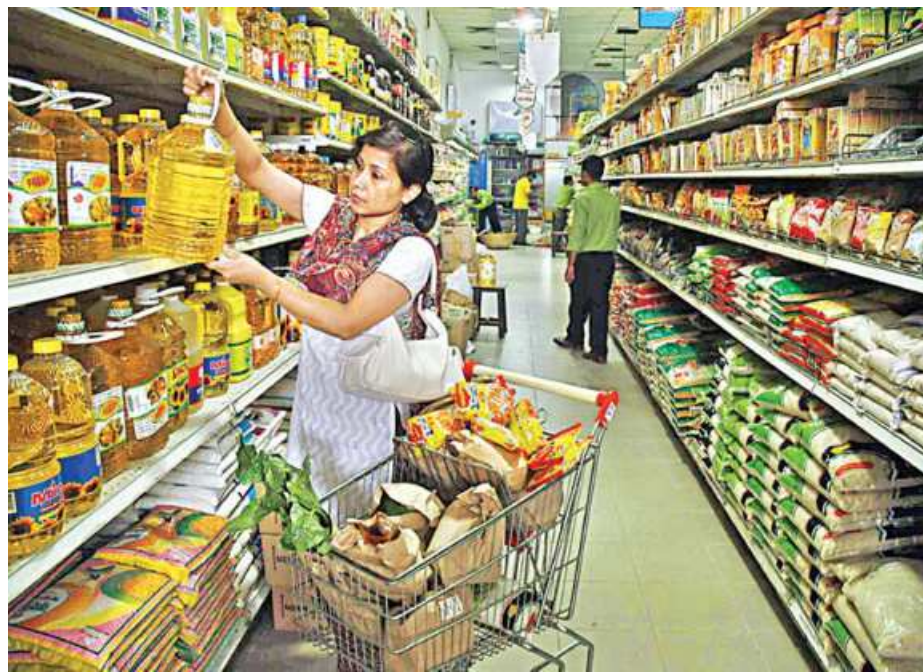
Price hike of essential commodities ahead of Ramadan is a common phenomenon in Bangladesh.

Costs have been fluctuating for the last few months due to a drop in production in