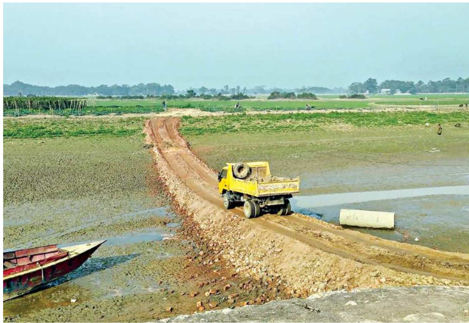
A vested quarter has built an illegal road across the Ubdakhali river in Netrakona's Kalmakanda upazila so that dirt could be carried to a brick kiln that has no DoE clearance. Locals say that influential people built the road taking advantage of the river going dry. During monsoon, the river plays an important role in the transportation of people and goods.