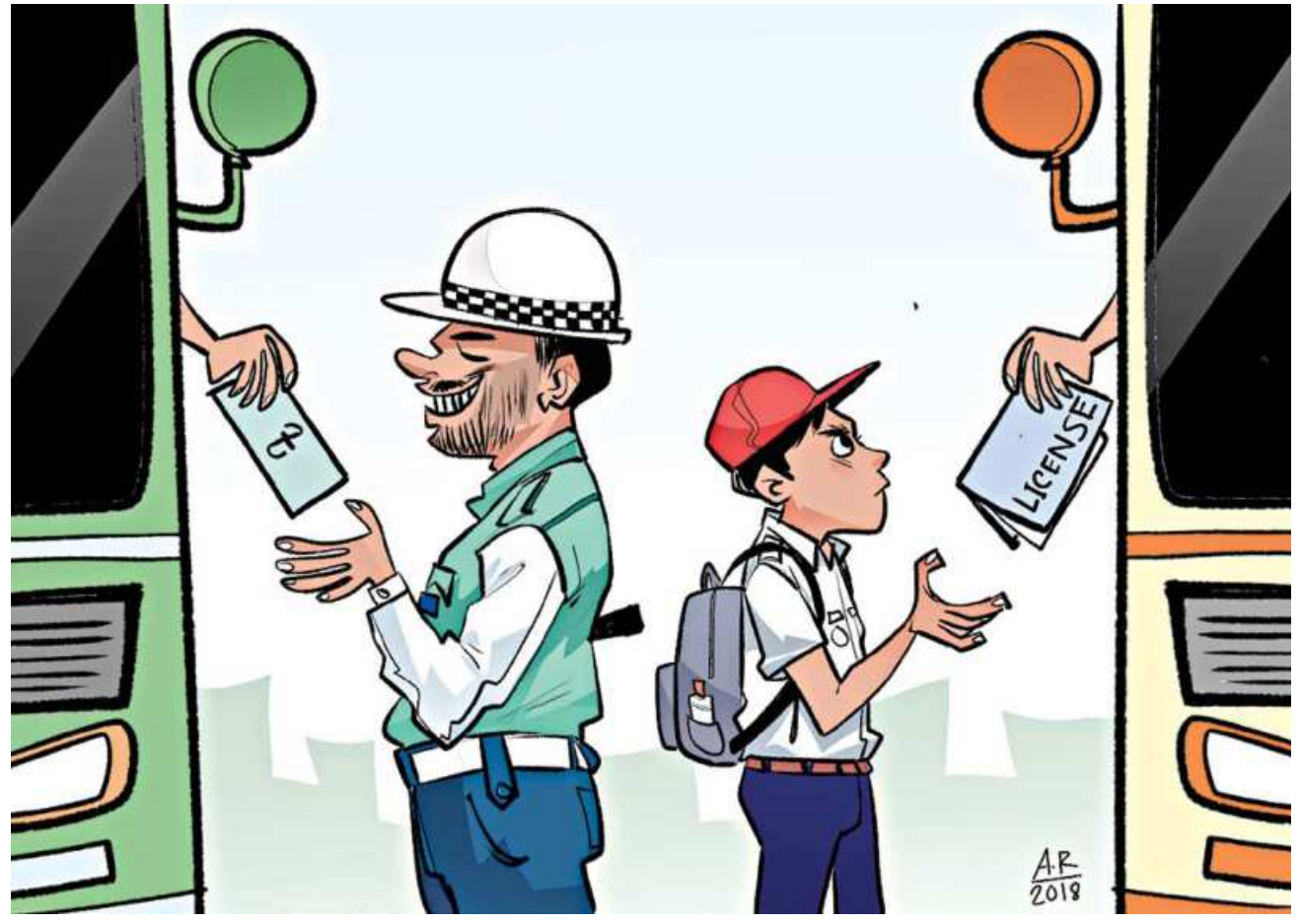
ARTWORK: ASIFUR RAHMAN