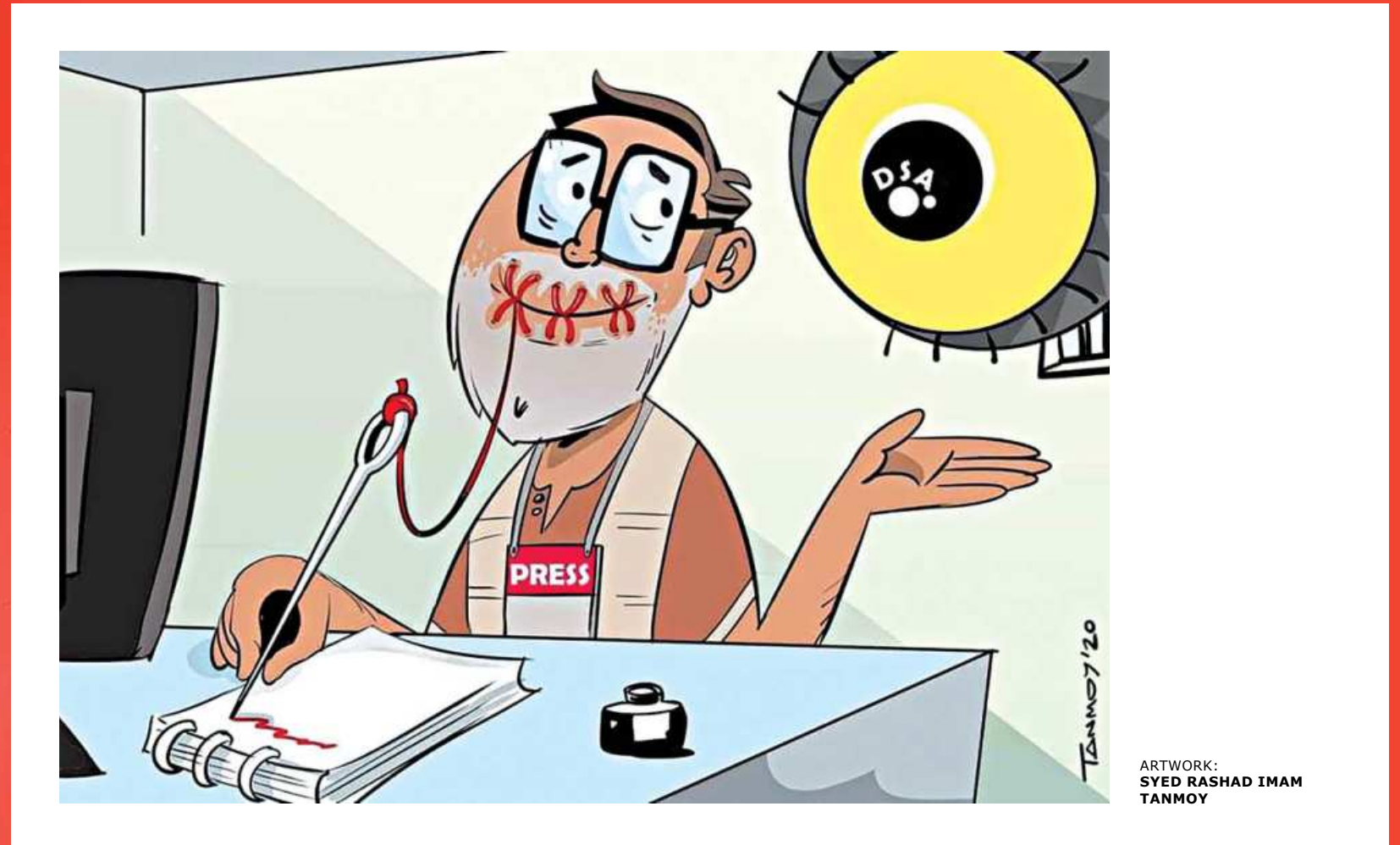
ARTWORK: SYED RASHAD IMAM TANMOY