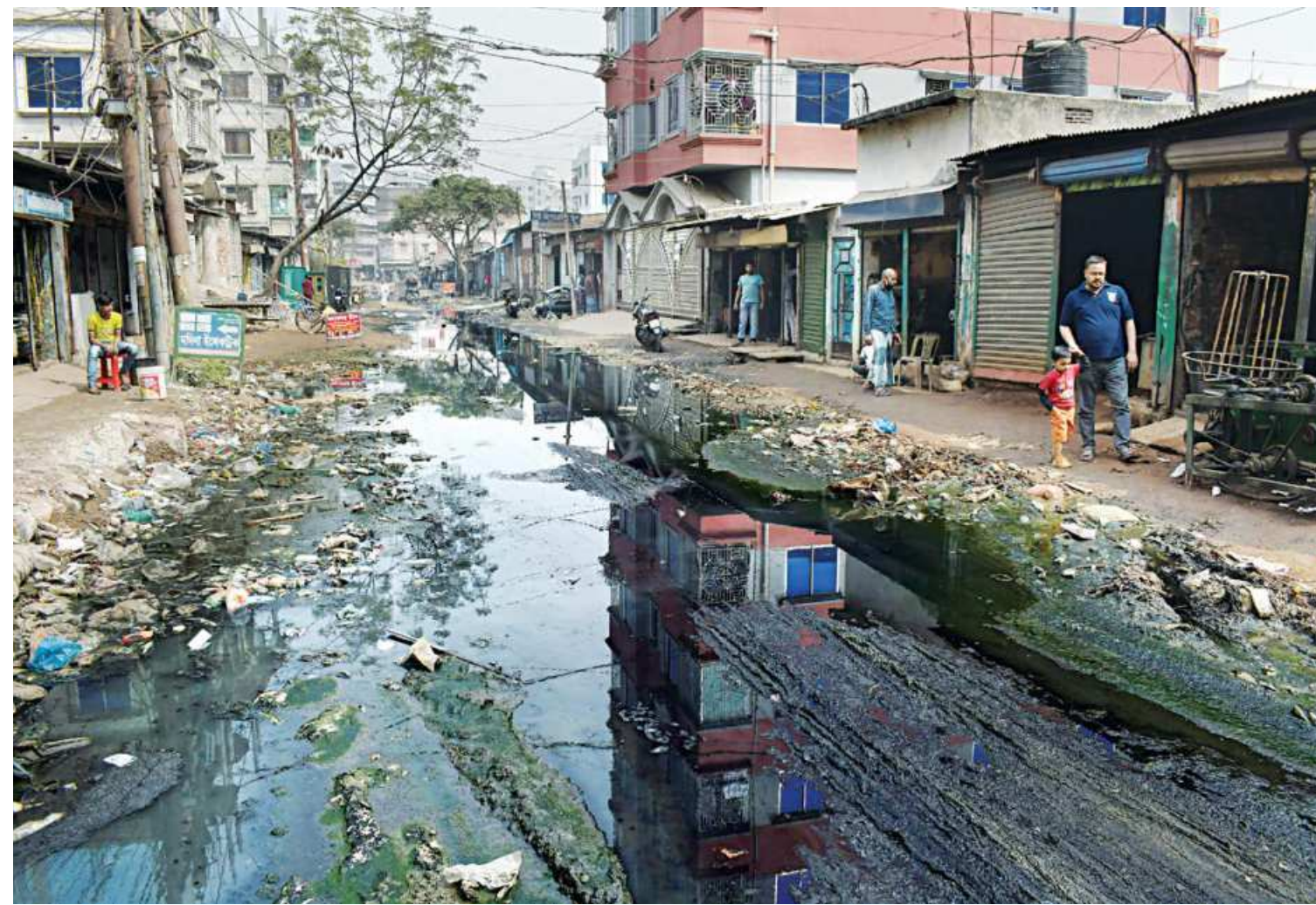
Filthy water from nearby dyeing factories and sewage stagnated on Shyampur-Kadamtoli street in the capital due to poor drainage system. Almost the entire street has become unusable. Pedestrians in Rajuk Residential area in Shyampur suffer the most as they have to endure the stench. The photo was taken yesterday.