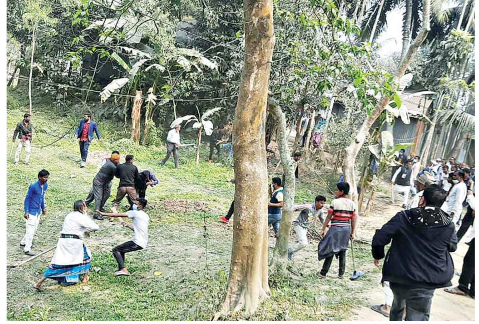
Supporters of Awami League and BNP mayoral candidates clash near Haripur Government Primary School Centre during Tangail's Kalihati municipal polls around 12:30pm yesterday. Five from both the groups were injured, two of them seriously. Story on page 1.

US President Joe Biden said on Saturday that the Senate's acquittal of former President Donald Trump for inciting an insurrection was a reminder that democracy was fragile, and every American had a duty to defend the truth. "This sad chapter in our history has reminded us that democracy is fragile," Biden said in a statement issued hours after the Senate failed to muster the two-thirds majority needed to convict Trump. Biden noted that a 57 senators -- including a record seven Republicans -- voted to find Trump guilty, following a bipartisan vote by the House of Representatives to impeach the Republican former president. "While the final vote did not lead to a conviction, the substance of the charge is not in dispute. Even those opposed to the conviction, like Senate Minority Leader (Mitch)