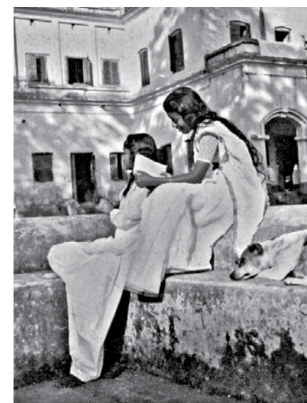
Unknown | Dhaka