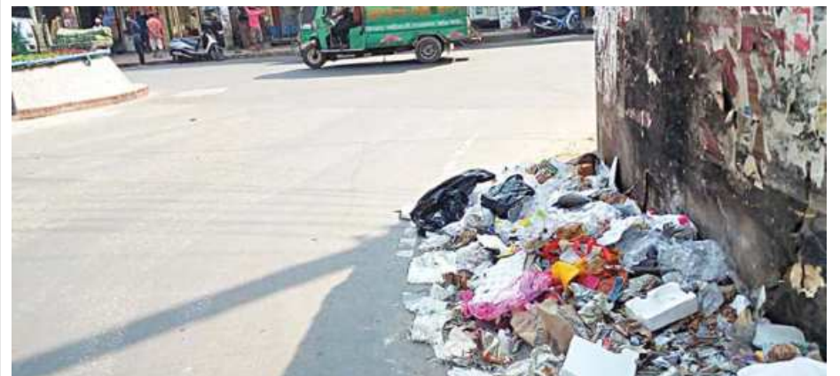
A heap of garbage just lies beside the wall near port city's Surson Road. The photo was taken recently.

The polls were held on January 27, and the new elected mayor and councillors took oath on Thursday.