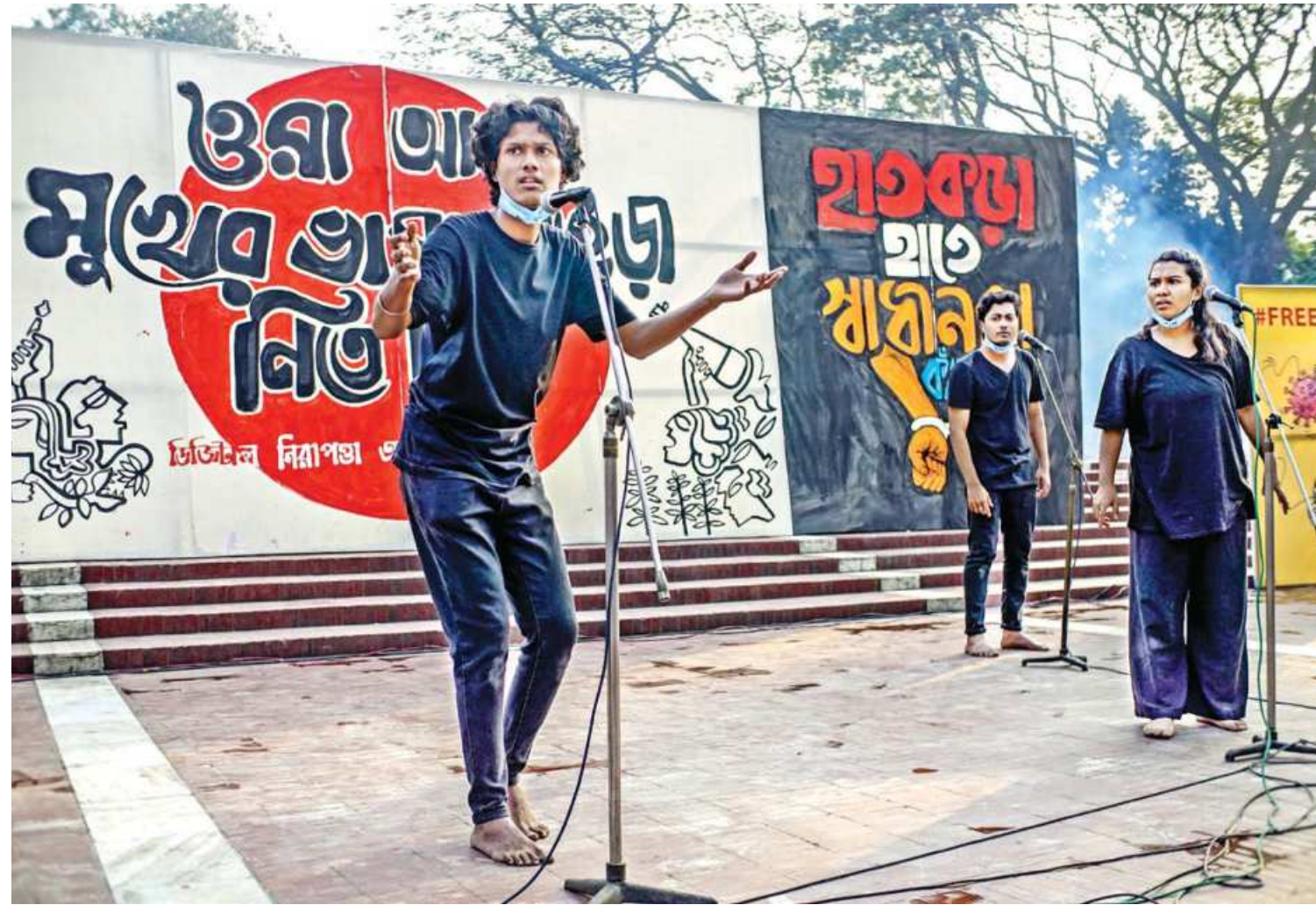
Activists perform a street play on Central Shaheed Minar in the capital yesterday. A group of citizens, including teachers and activists, demonstrated there demanding Digital Security Act be abolished as it was being used for suppressing freedom of expression.