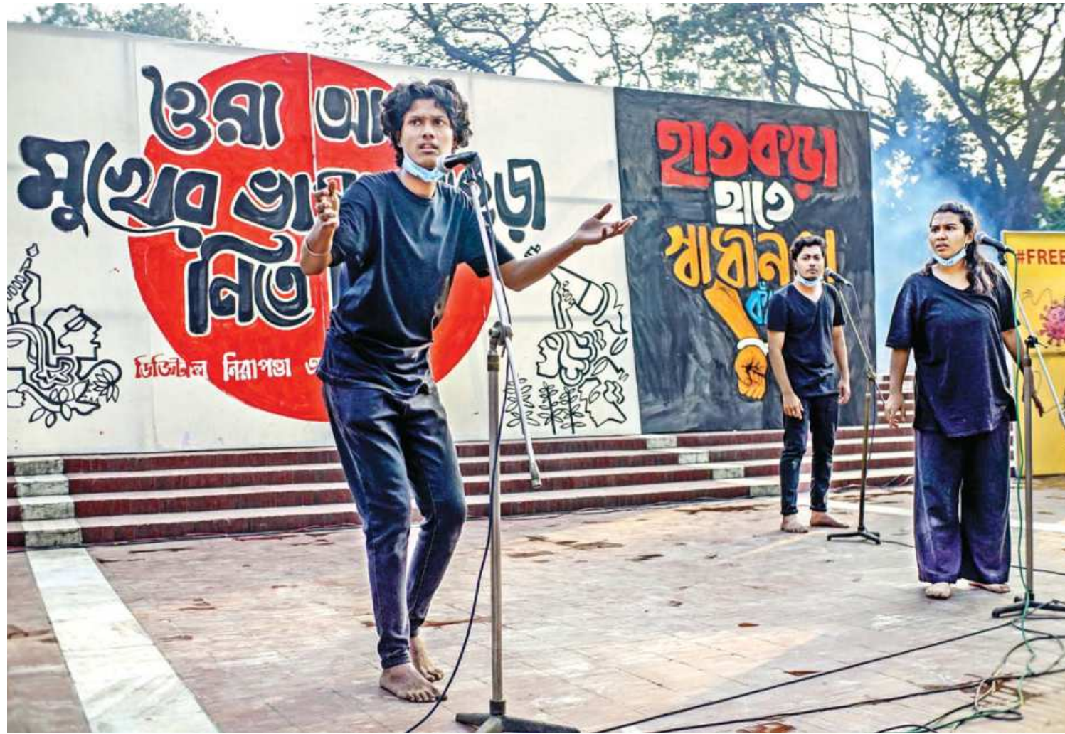
Activists perform a street play on Central Shaheed Minar in the capital yesterday. A group of citizens, including teachers and activists, demonstrated there demanding Digital Security Act be abolished as it was being used for suppressing freedom of expression.