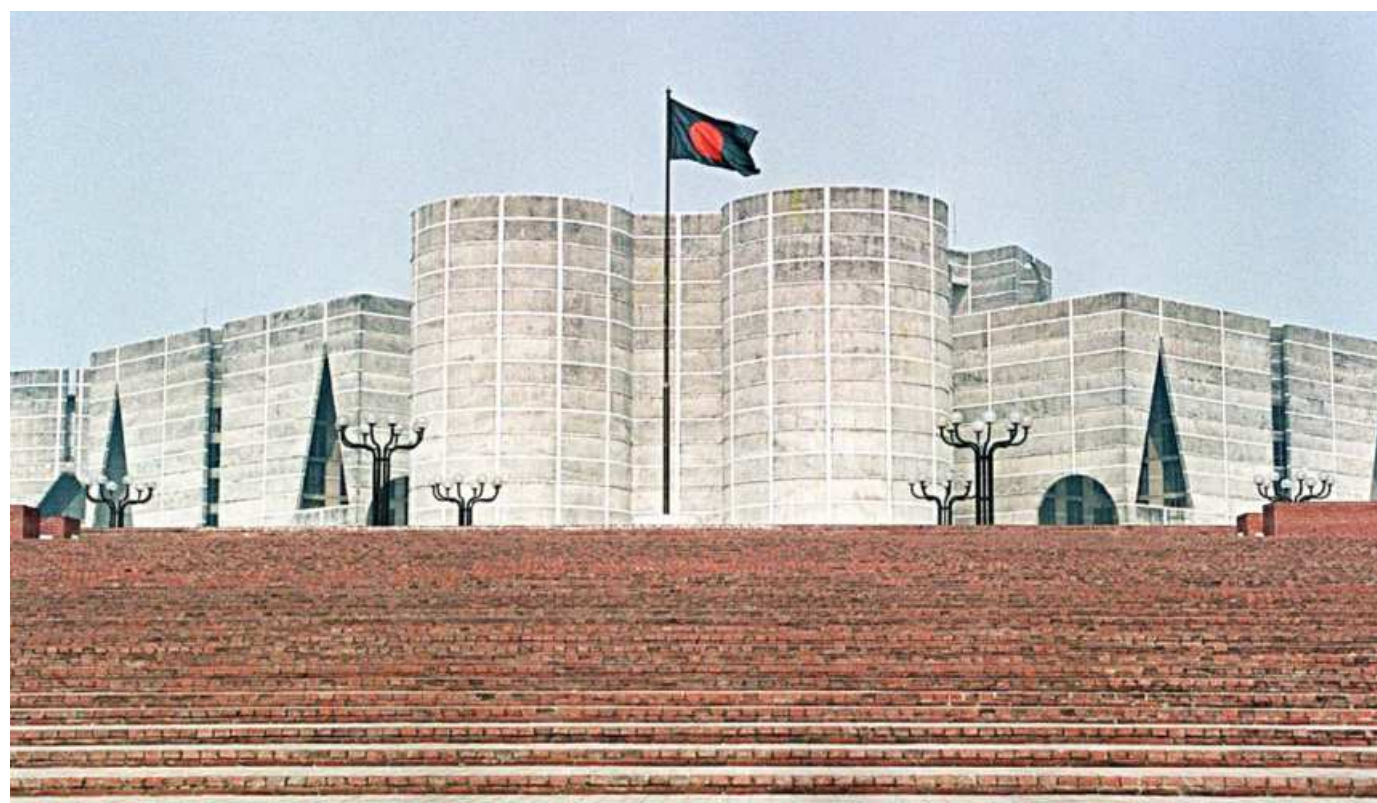
The Bangladesh parliament building.

A pliant subservient parliamentary opposition cannot supplant real political opposition. Suppressing it does no favour to any of the stakeholders, least of all the ruling party. If the opposition in the parliament has not gained the trust of the