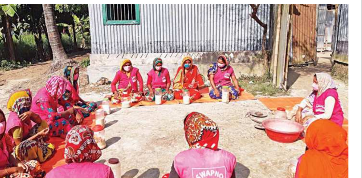
A group of women from ultra-poor families having discussion before depositing their saved fistful rice in 'Musti Chale Unnayan' centre at Rajpur village in Lalmonirhat Sadar upazila.

SWAPNO women are now a lesson for other women especially from the ultra-poor families in the district, the DC also said.