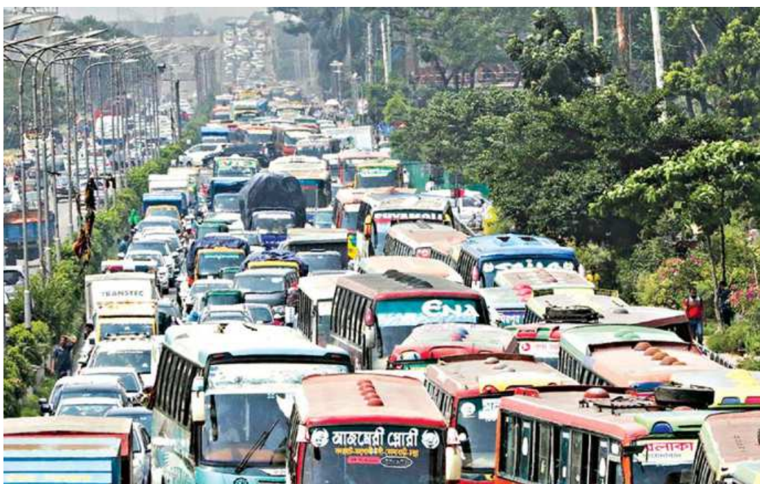
Bus service in Dhaka has a lot to improve in general, but for thousands of daily commuters, they are still the prime option. Having the information on which vehicle to take at your fingertips will only make it more accessible. Below, a Google Maps search from Banasree to Mirpur Zoo shows four options, including service providers' names and routes.

Right here, the biggest issue when it comes to using public