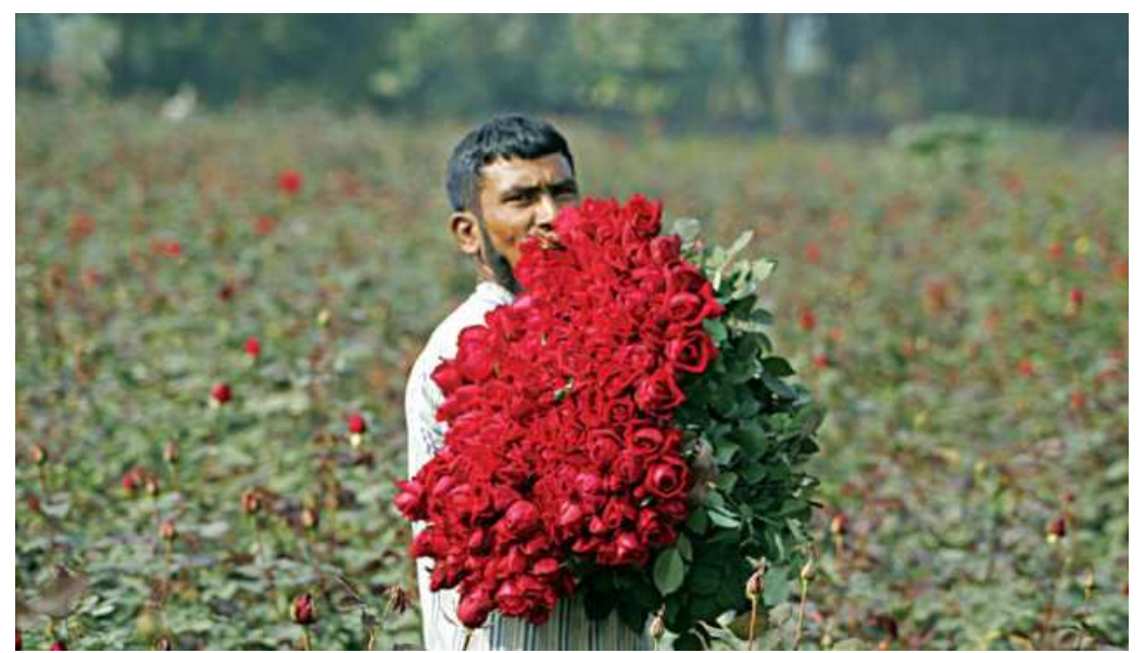
A grower holds roses that he plucked from his garden at Golapgram in Savar's Shyampur area yesterday.