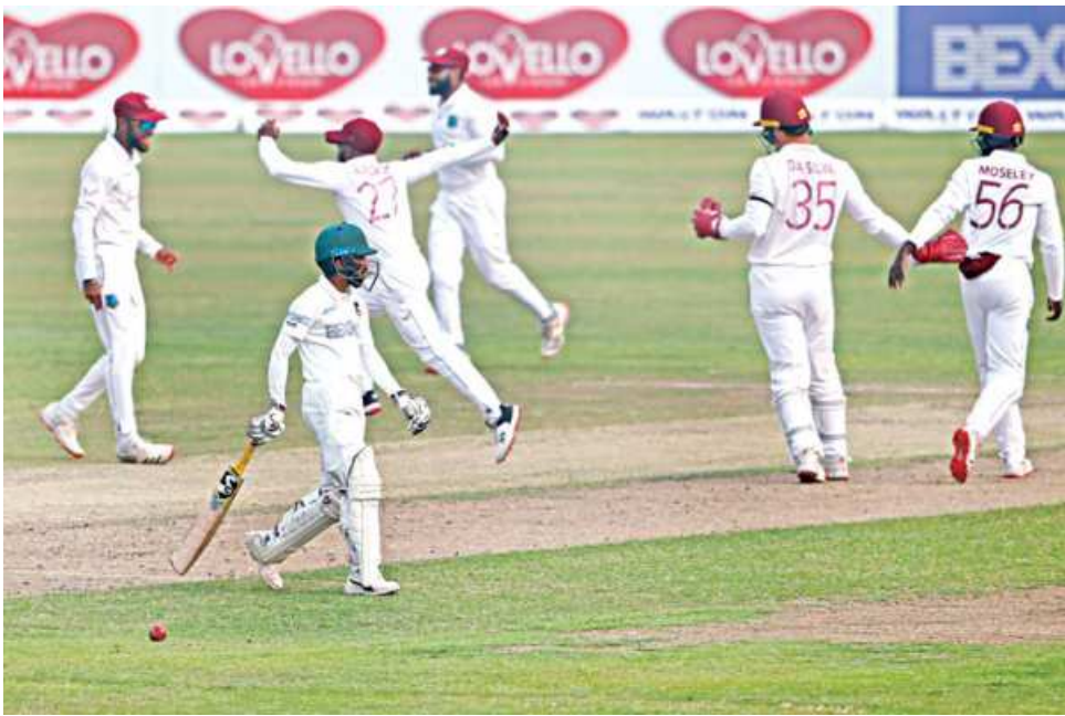
West Indian players celebrate the dismissal of Bangladesh captain Mominul Haque as the visitors tightened the screws on the home team with an excellent bowling display after scoring 409 runs in the first innings of the second Test at the Sher-e-Bangla National Stadium in Dhaka yesterday.

It was a 12th consecutive innings where the Tigers’ openers were unable to go past