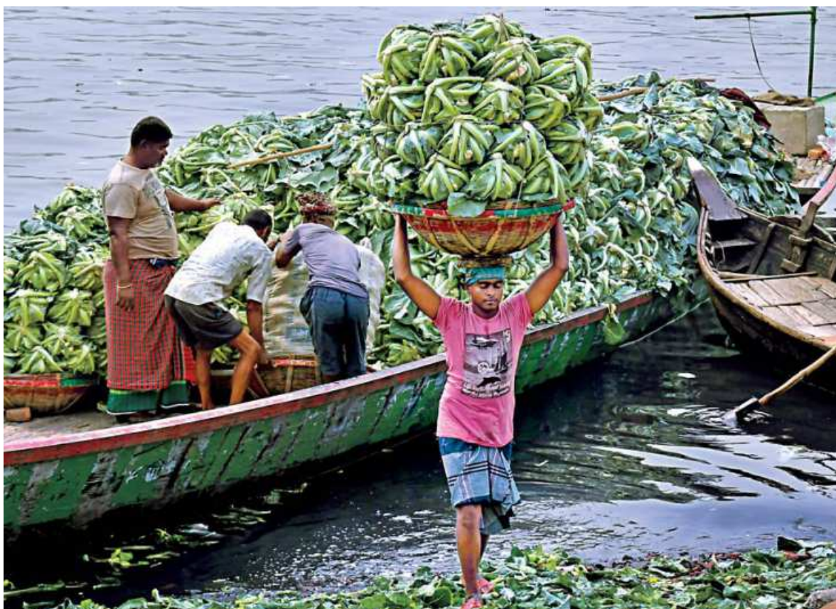
Workers unload vegetables from a boat in the capital's Shyambazar area yesterday. Prices of vegetables have witnessed a sharp fall across the country in recent weeks, thanks to abundant supplies of winter crop. Wholesalers are selling cauliflowers for about Tk 5 a piece, depending on size.