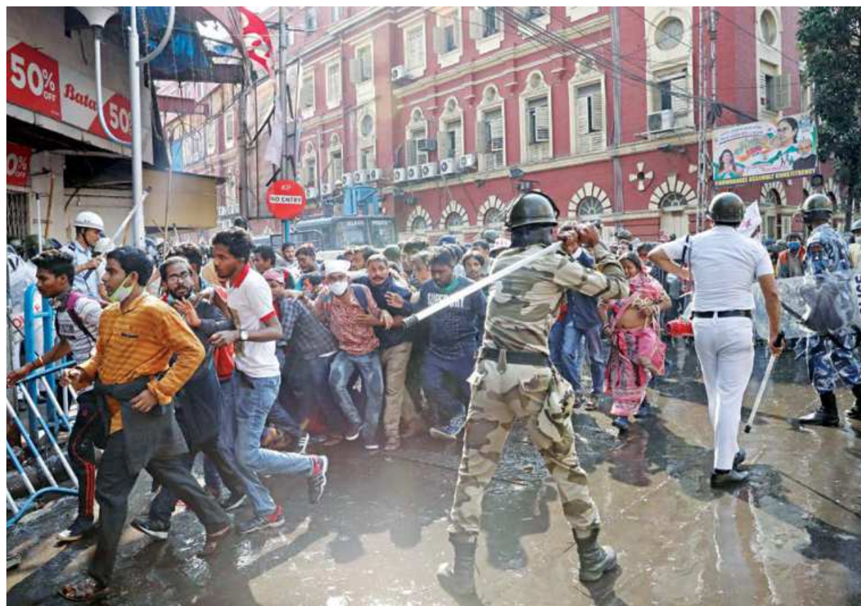
Police officers wield their batons against activists from various student unions during a protest march demanding jobs and better education facilities, in Kolkata, India, yesterday.

Ryabkov said Iran's move demonstrated Tehran's "determination not to put up with the current situation," after it warned that time was running out for US President Joe Biden's administration to save the agreement.