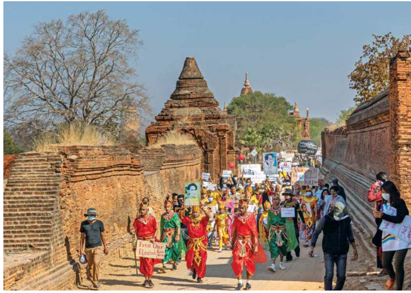
People wearing costumes march with placards in a protest against the military coup and to demand the release of elected leader Aung San Suu Kyi, in the ancient city of Bagan, Myanmar, yesterday.

Chinese state media reported simply that the two sides "exchanged in-depth views on bilateral relations and major international and regional issues."