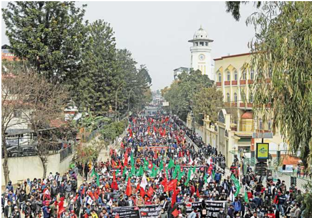
Supporters of a faction of the ruling Nepal Communist Party take part in a rally during mass gathering against the dissolution of parliament, in Kathmandu, Nepal yesterday.

In reply, the CEC on December 24 said the allegations over the Tk 2-crore expenditure were made on false grounds. The eminent citizens in their second letter on January 17 again raised allegations of irregularities in the EC's expenditure on training programmes. They cited a media report that some of the EC officials embezzled at least Tk 11 crore from the training budget. The report also made mentions of allegations against 18 people, including the CEC, commissioners and top EC officials that they took at least Tk 3 crore of the Tk 11 crore.