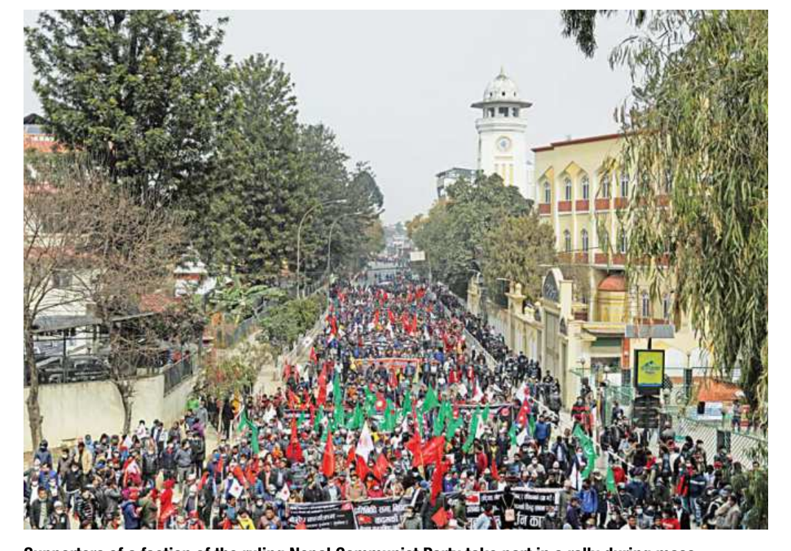
Supporters of a faction of the ruling Nepal Communist Party take part in a rally during mass gathering against the dissolution of parliament, in Kathmandu, Nepal yesterday.