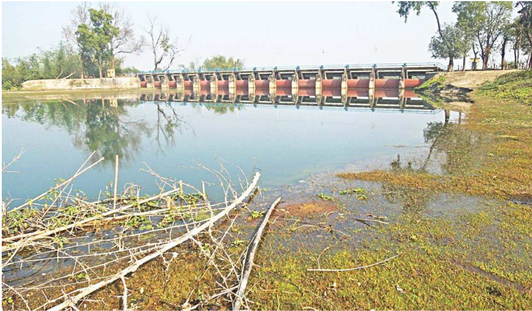
Recent photo of the Buri Teesta irrigation reservoir, in Dimla upazila of Nilphamari, after unknown individuals released water from it recently.