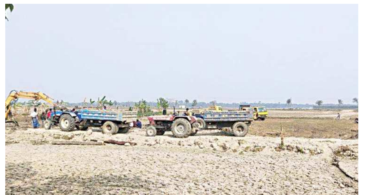
Labourers collecting topsoil from a farmland for making bricks at different nearby brickfields in Jashore's Chaugachha upazila.