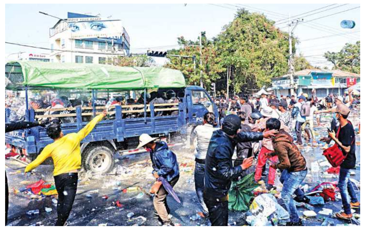
Demonstrators riot against police as they protest against the military coup and demand the release of elected leader Aung San Suu Kyi, in Mandalay, Myanmar yesterday.

Agitated teachers put the demand before the roads and highways ministry through the Pabna deputy