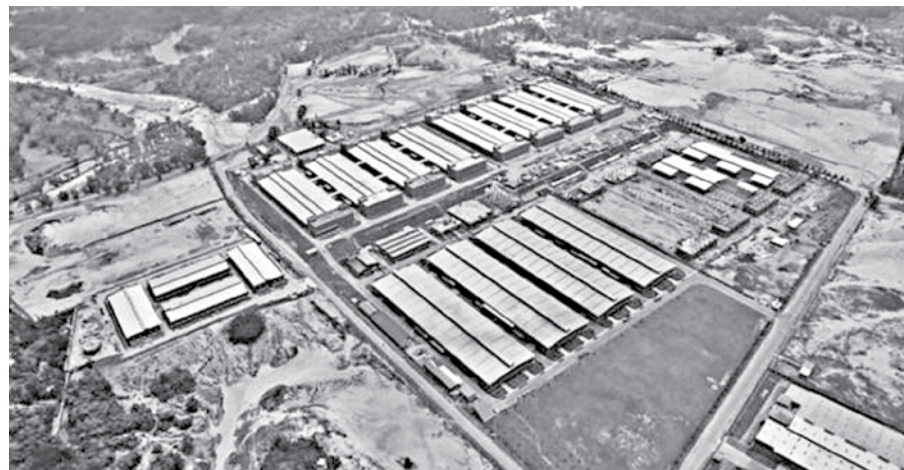
Bangladesh is keen to operationalise its proposed Economic Zones and high-tech parks, with foreign investments from public and private sectors.

Dr. A K Abdul Momen, MP is Foreign Minister of the Government of the People's Republic of Bangladesh.