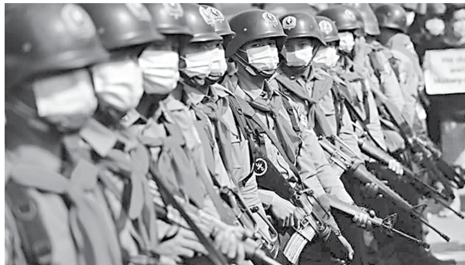
Armed police confront protesters on the streets of Naypyitaw, Myanmar's capital, on Monday, February 8.

Copyright: Project Syndicate, 2021. www.project-syndicate.org (Exclusive to The Daily Star)