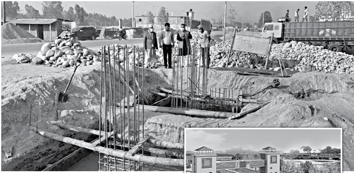
Construction work of Bangabandhu Sheikh Mujib Square in Panchagarh's Tentulia upazila is going on in full swing. Inset, the design of Bangabandhu Sheikh Mujib Square.

Police said they recovered the body and sent it to the hospital for autopsy.