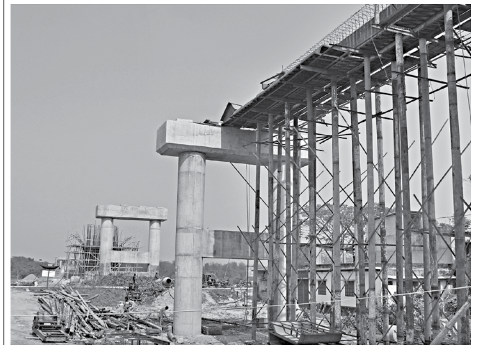
The current state of the under construction bridge on the Lohalia river near Patuakhali town.