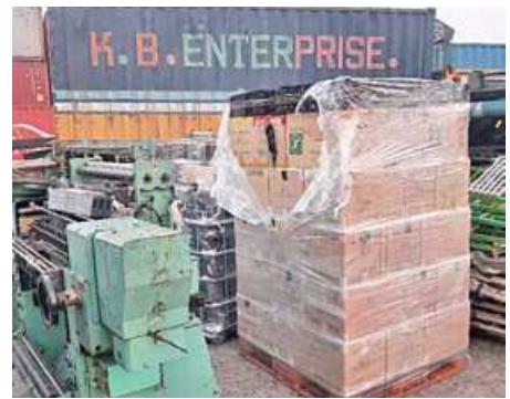
Electrical items and power looms are seen that were imported under false declaration.