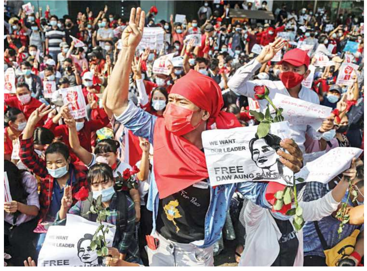
(From right, anti-clockwoise) People show the three-finger salute and hold signs demanding the release of elected leader Aung San Suu Kyi as they take part in a protest against the military coup, in Yangon, yesterday; cops threatens with riffles as they continue to disperse protesters in Myawaddy; and a woman holds a candle as Myanmar citizens protest against the military coup in Bangkok.