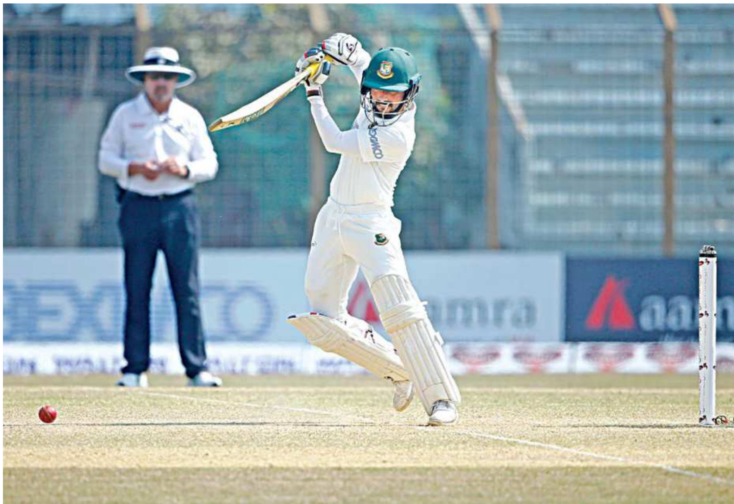
Bangladesh Test captain Mominul Haque drives through the off side during his record 10th Test century for Bangladesh on the fourth day of the first Test at the Zahur Ahmed Chowdhury Stadium in Chattogram yesterday. The left-hander scored 115 off 182 balls to help set a 395-run target for West Indies, who finished the day at 110-3. Story on page 12.