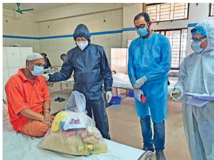
BANCAT Eid Meet