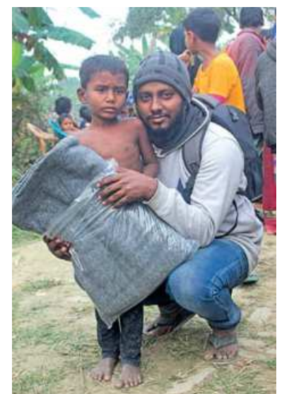
BANCAT Winter Smile