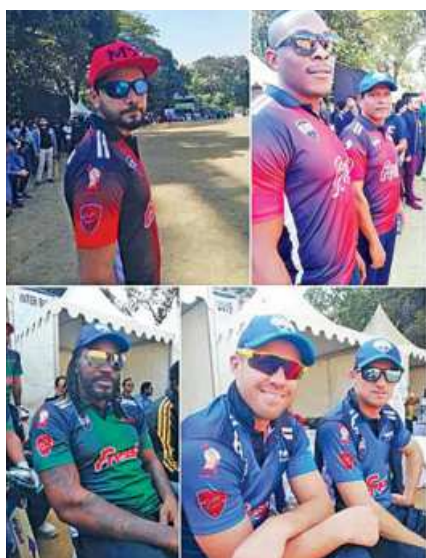
BANCAT Cricket for Cancer

BANCAT - Bank Asia, Scotia Branch Account Number: 00733004894 BANCAT - Prime Bank, Banani Branch Account Number: 2132111021363