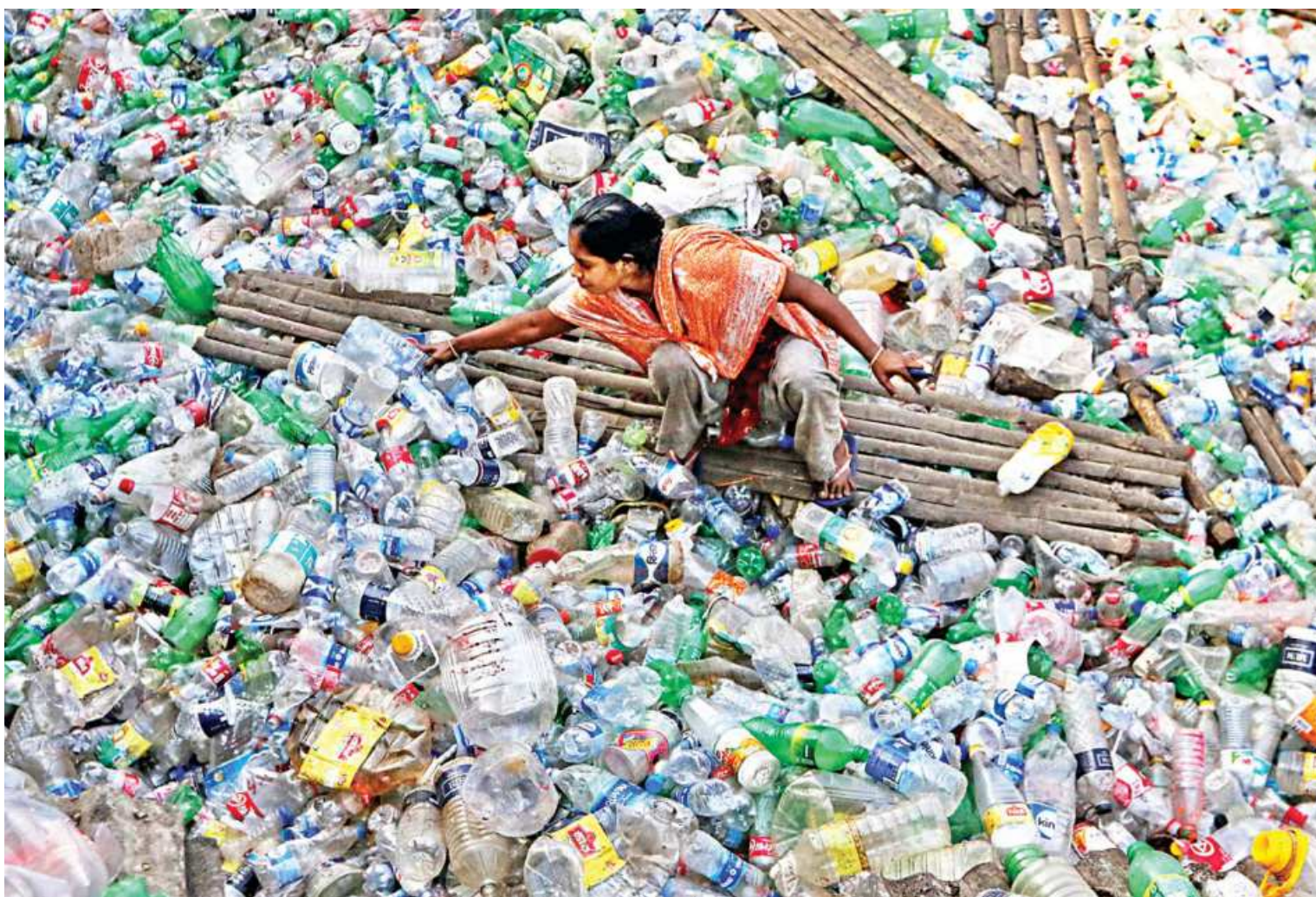
A woman removing the labels and caps from single use plastic bottles she and others have collected in the capital's Meradia area. Plastic recyclers buy these bottles from her. She says her monthly earnings range from Tk 5,000-7,000.