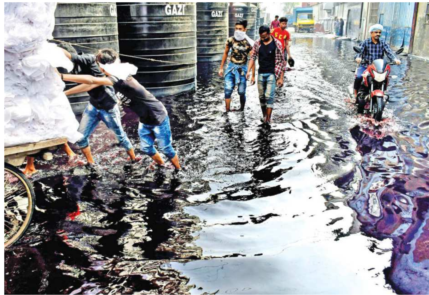
The waste of a dyeing factory accumulated on a street in the capital's Kadomtoli, Shyamoli area. Such mismanaged waste makes locals suffer immensely on Road-12 and nearby Gazi Tank areas. The photo was taken recently.

A number of renowned economists and industrialists have urged the government not to give the scope for whitening black money in the next fiscal year. Only a handful of individuals are reaping the benefits of Bangladesh's astounding GDP growth due to the discriminatory provision of whitening black money. This is escalating economic disparity in the country, they said at a webinar yesterday. Eminent economist Rehman Sobhan, chairman of the Centre for Policy Dialogue, said, "Corrupt individuals who have amassed astronomical amount of money are getting amnesty just by paying a nominal amount of money as tax. This money whitening process will sharply increase economic discrimination in the country," he pointed out at the webinar titled "Black money being whitened: Beneficial or harmful for the economy?" organised by Citizen's Platform for SDGs. Dr Debapriya Bhattacharya, distinguished fellow at the CPD, said, "Money earned by committing crimes and corruption is being termed undisclosed income and being whitened by paying tax." This directly collides with the constitution because it has been clearly stated in the charter that the state will create such conditions that none will be able to possess and benefit from unaccounted income, he noted.