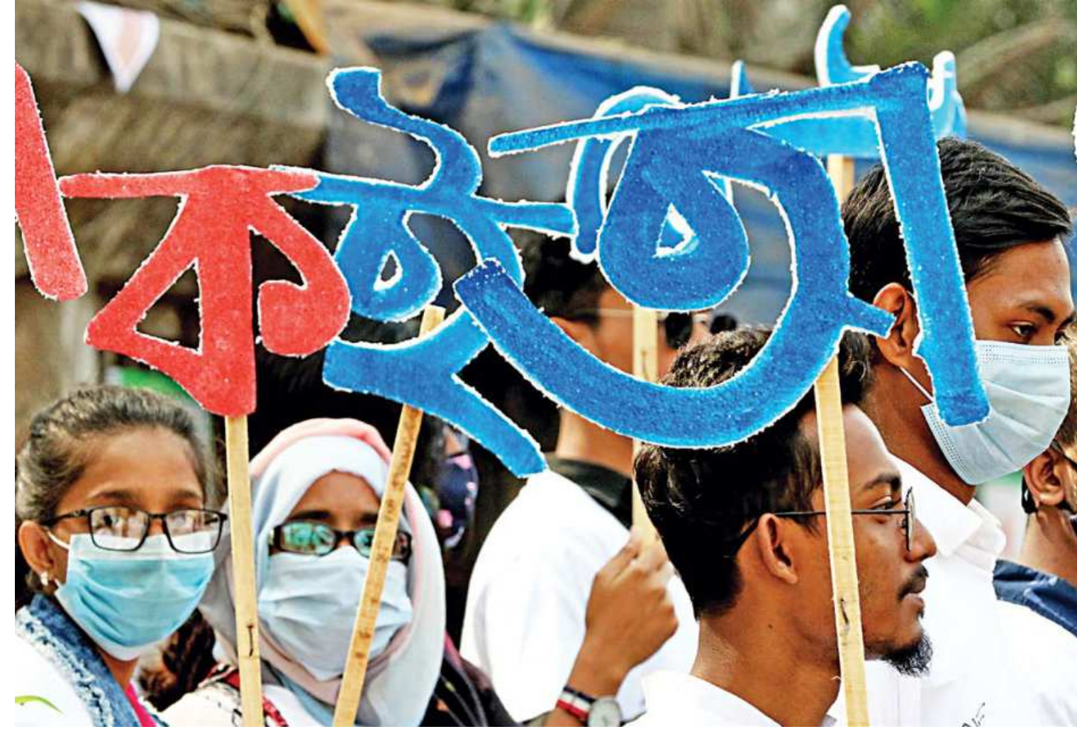
Members of the Chhatra Union attending a human chain and rally in front of the National Press Club demanding proper uses of the Bangla language. The photo was taken yesterday.