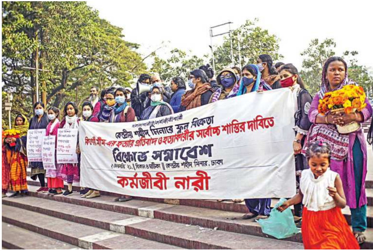
Kormojibi Nari, a women's rights organisation, stages a rally at the Central Shaheed Minar in the capital yesterday, protesting the recent murder of a 15-year-old girl, who used to sell flowers on the Dhaka University campus. Speakers at the rally demanded maximum punishment for the killer.