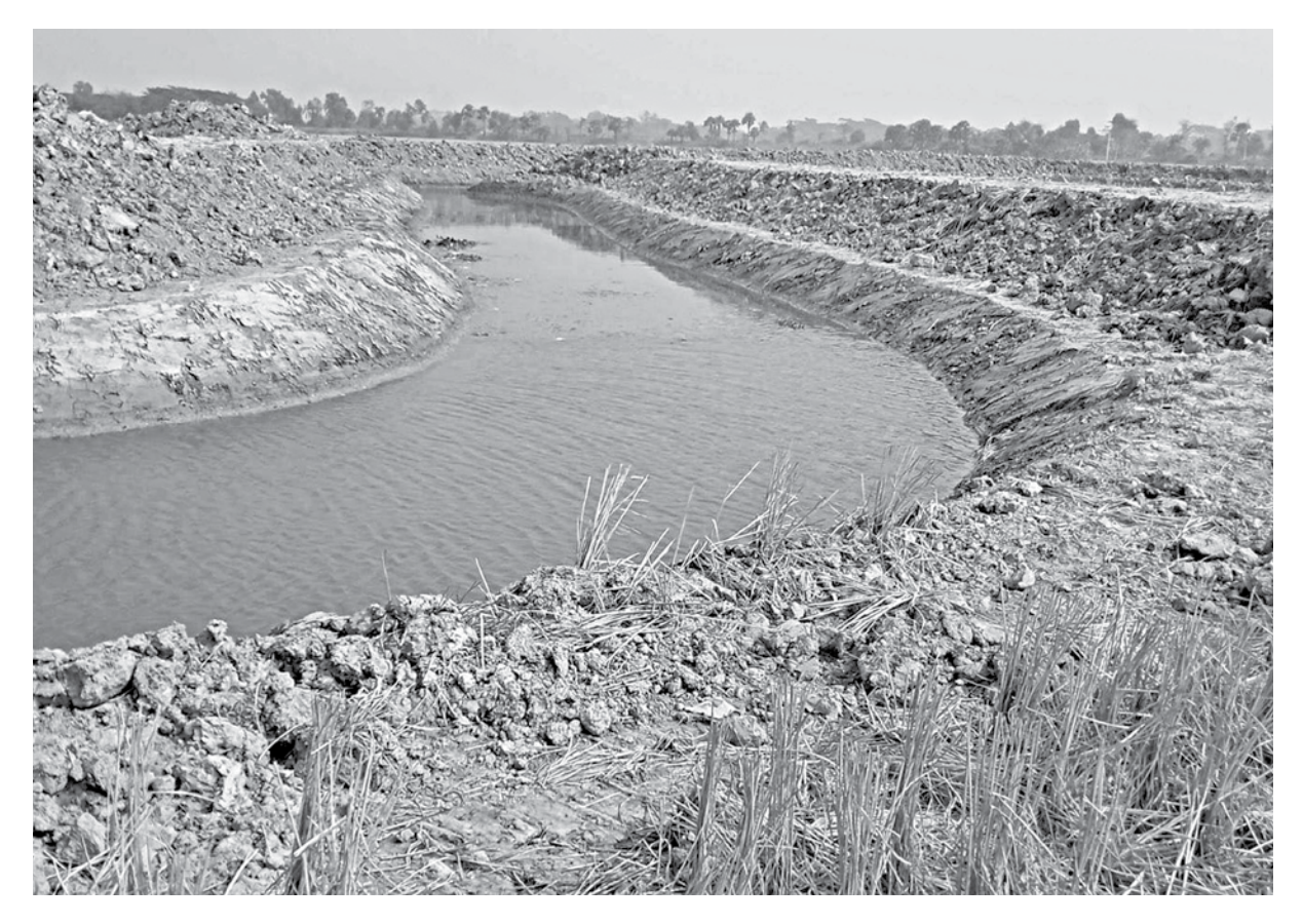
One of the re-excavated canals that became a source of hope for farmers in three villages of Patuakhali's Kalapara upazila. The photo was taken recently.