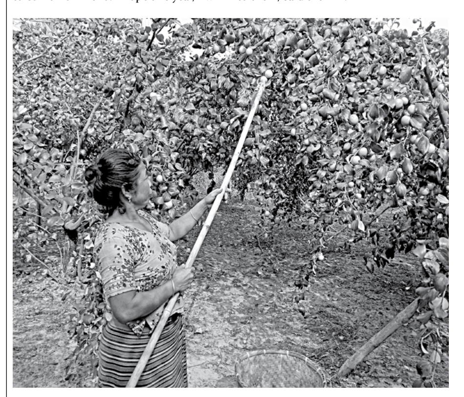
A jujube grower works at her orchard in Bodhipur area of Rangamati.

Day by day farmers have been interested in growing jujube as it brings good profit to them, said the DD.