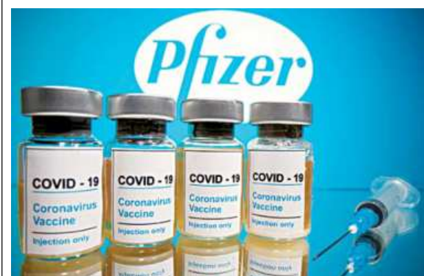
Vials and a medical syringe are seen in front of a displayed Pfizer logo in this illustration.

The company said it expects total 2021 revenue of between $59.4 billion and $61.4 billion.