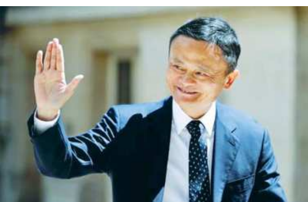
Chairman of Alibaba Group Jack Ma

The Shanghai Securities News said that while some of the entrepreneurs it praised had once behaved like "reckless heroes" in their efforts to break away from an old, rigid economic system, they now led "a group of companies that respected the rules of development and abided by market rules."