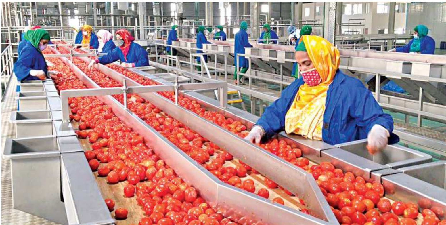
Women process tomatoes at a plant of Pran in Barind Industrial Park in Godagari, Rajshahi.