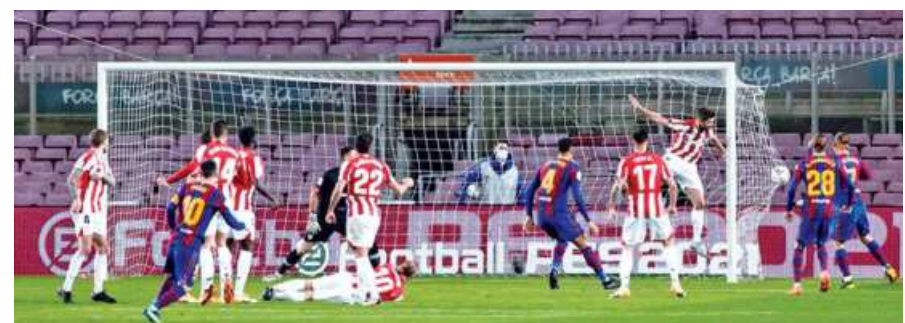
Lionel Messi (L) scores his 650th goal for Barcelona from a sublime free-kick during his side's 2-1 victory over Athletic Bilbao in a La Liga home match on Sunday, avenging a defeat by the Basque side in the Spanish Super Cup final.

Few can argue with Messi's contribution in that regard, with the 33-year-old showing against Bilbao why the club have gone to such lengths to keep him.