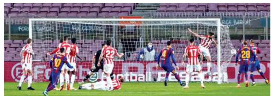
Lionel Messi (L) scores his 650th goal for Barcelona from a sublime free-kick during his side's 2-1 victory over Athletic Bilbao in a La Liga home match on Sunday, avenging a defeat by the Basque side in the Spanish Super Cup final.

Few can argue with Messi's contribution in that regard, with the 33-year-old showing against Bilbao why the club have gone to such lengths to keep him.