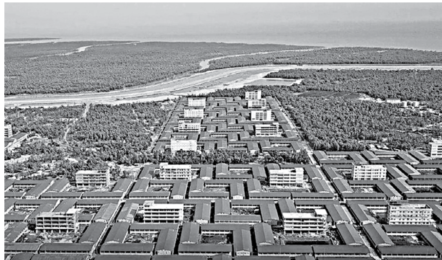
An aerial view of the buildings intended for accommodating Rohingya refugees at Bhashan Char.

In Bangladesh, like in many developing countries, researchers and policy or decision-makers live in separate silos.