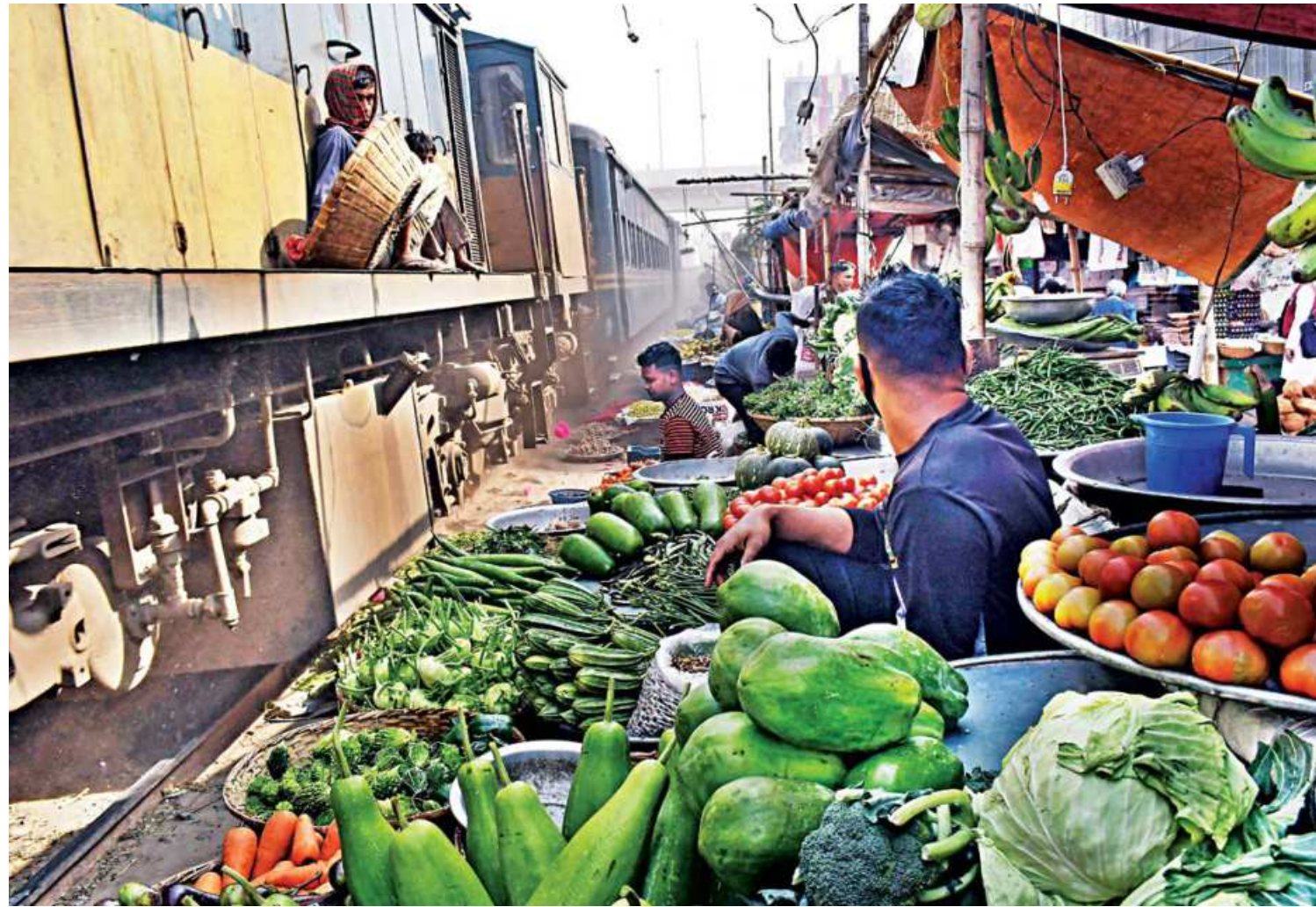
A train crossing in the capital's Jurain area yesterday. Ignoring the risks, traders set up makeshift shops for selling vegetables and fruits on both sides of the rail lines. Every time the authorities evict them, the traders return a few days later. Accidents may happen anytime.