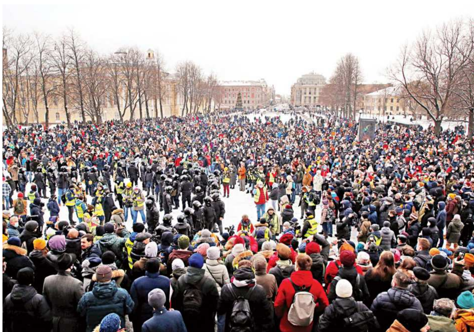
A general view of a rally in support of jailed Russian opposition leader Alexei Navalny in Saint Petersburg, Russia, yesterday.