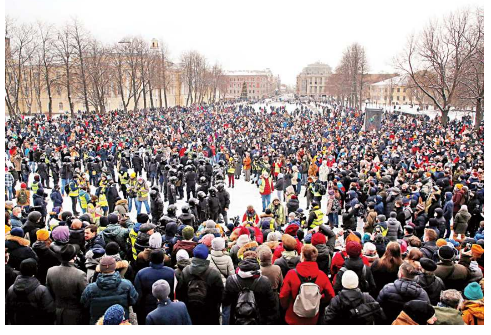
A general view of a rally in support of jailed Russian opposition leader Alexei Navalny in Saint Petersburg, Russia, yesterday.