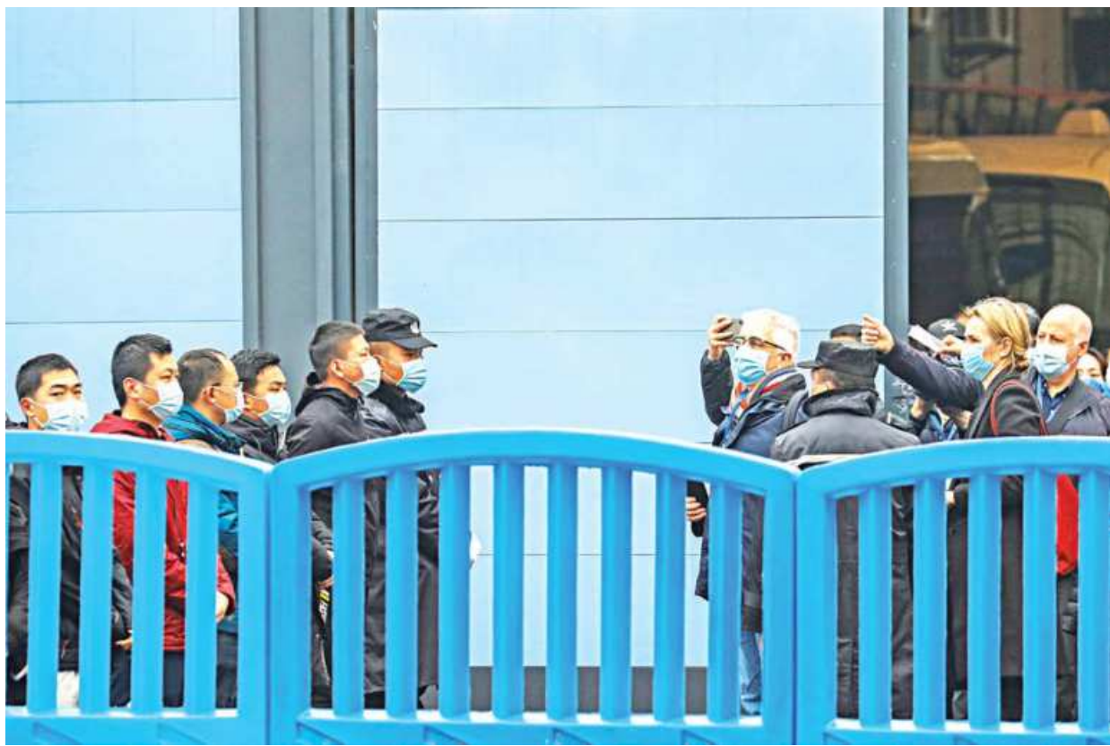
Security personnel keep watch as members of the World Health Organization (WHO) team tasked with investigating the origins of the coronavirus disease visit Huanan seafood market in Wuhan, Hubei province, China yesterday.