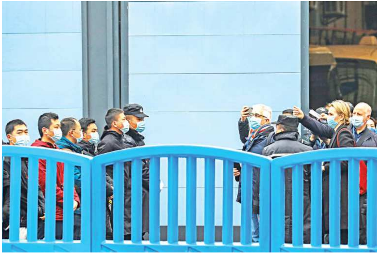
Security personnel keep watch as members of the World Health Organization (WHO) team tasked with investigating the origins of the coronavirus disease visit Huanan seafood market in Wuhan, Hubei province, China yesterday.