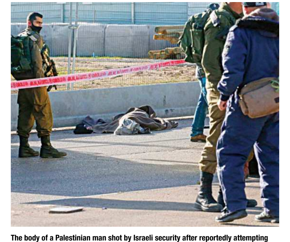
a knife attack, lies on the side of the road, near Gosh Etzion, north of Hebron city in the occupied West Bank yesterday. Gosh Etzion is a bloc of two dozen Israeli settlements and outposts near Bethlehem.

- via video-conferencing - a rally in Howrah district. Shah's swipe comes a day after he personally welcomed five former members of the Trinamool into the BJP, to continue a flood of defections from the ruling party that began with ex-Nandigram MLA and cabinet minister Suvendu Adhikari. "Mamata Banerjee should reflect on why so many Trinamool Congress leaders are joining the BJP. It is because she has failed the people of the state. By the time elections arrive, she will be left all alone," the Home Minister was quoted by news agency PTI.